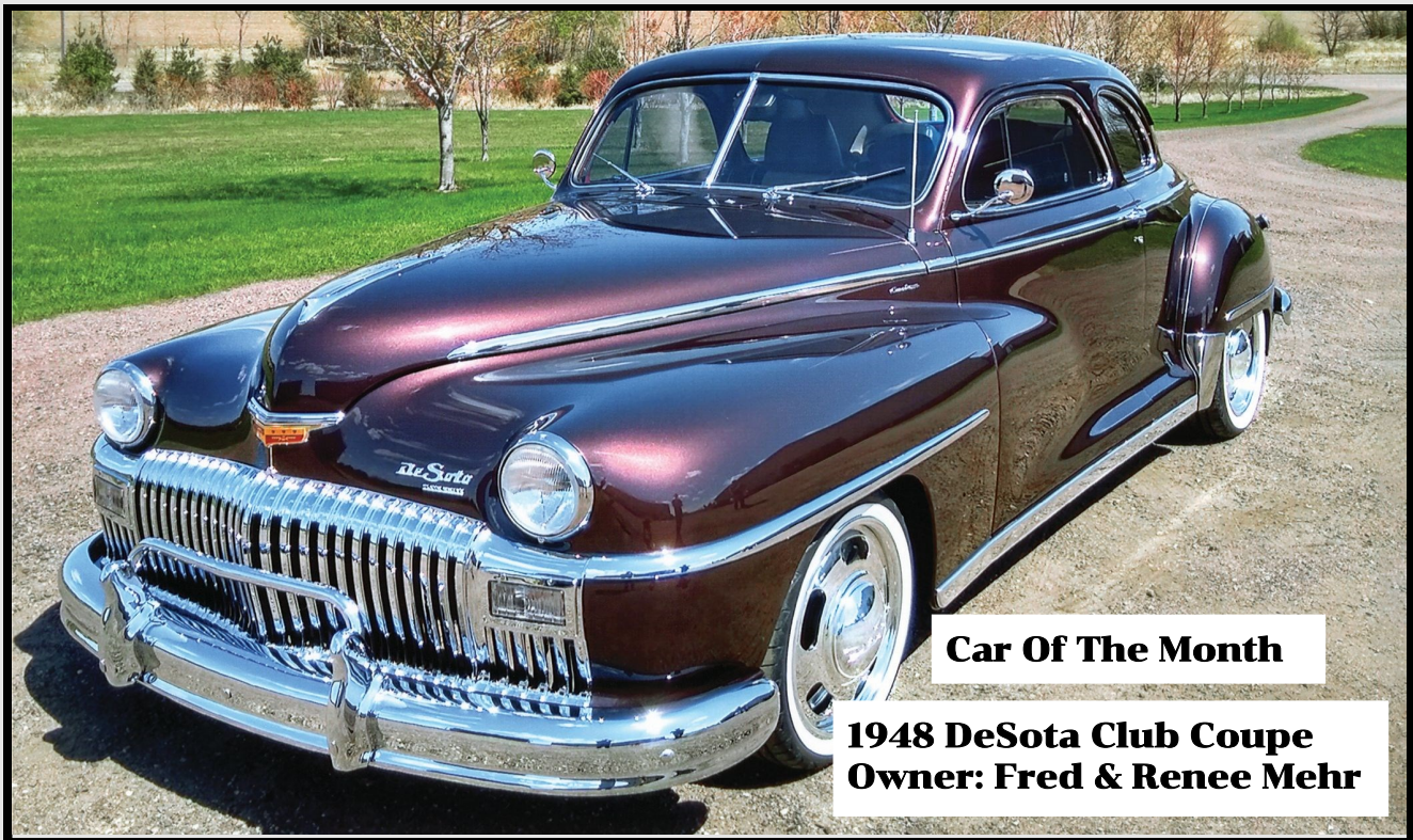
Car Of The Month