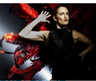
E Z LEA MON 3 SEP. HM

TVATING INECTIONS ITHALICIA JONES ACT SAT 1 SEP, HM