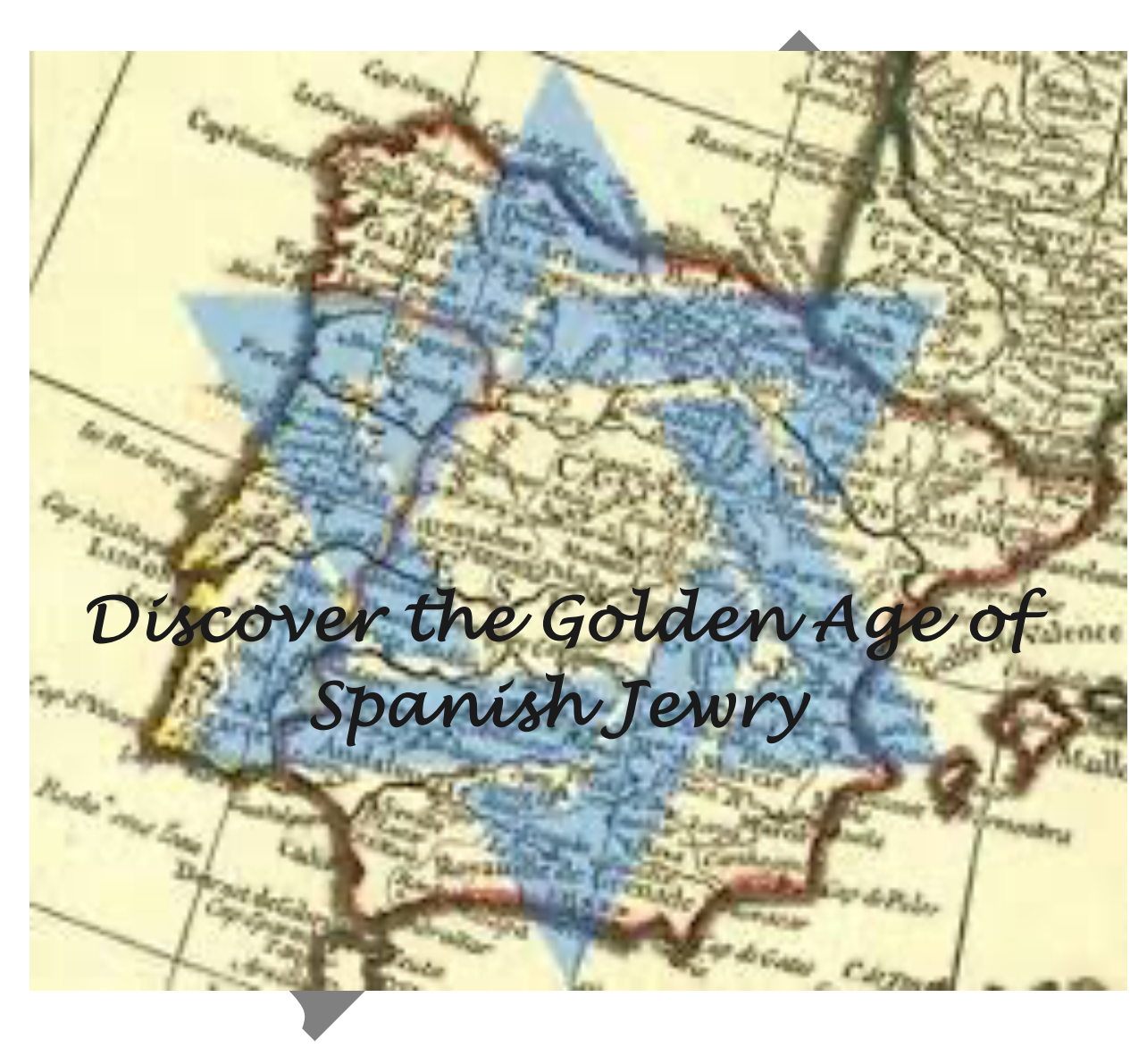
A 9 days/8 nights Jewish Heritage Journey throughout Spain November 13<sup>th</sup> - 20<sup>th</sup> 2024 (optional 4-days extension to Barcelona November 20<sup>th</sup> - 24<sup>th</sup> 2024)