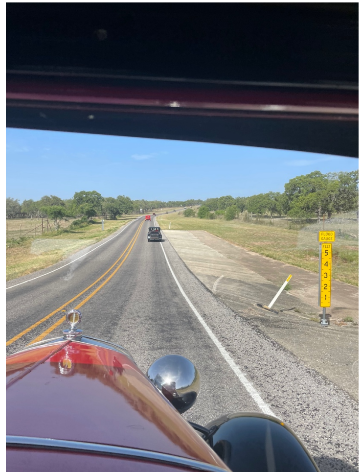
Facebook Beehive Model A's