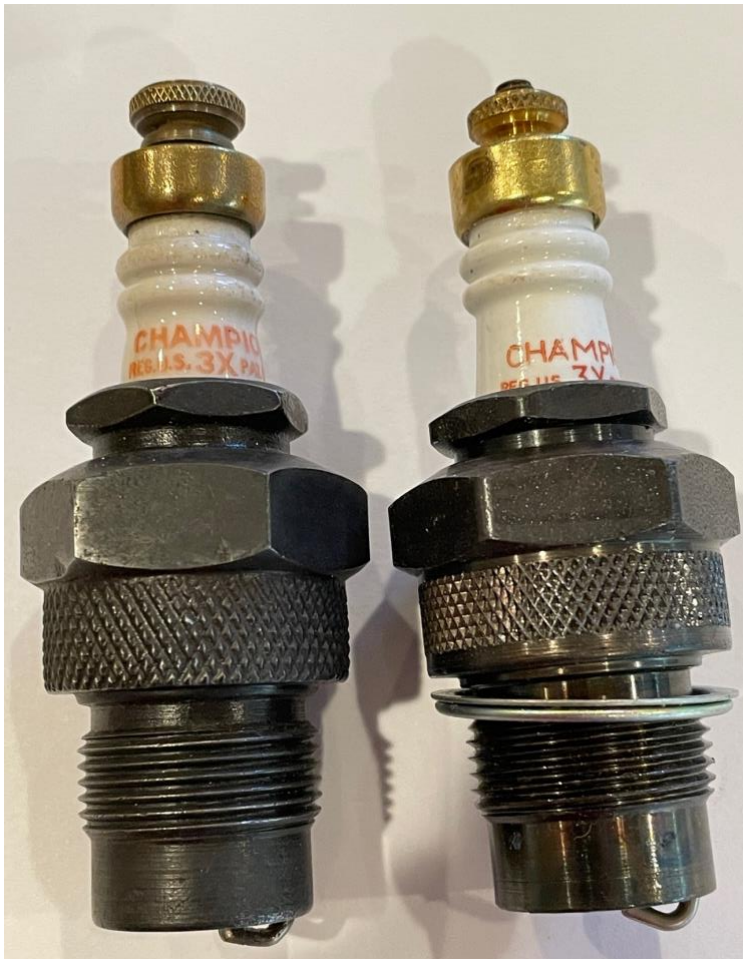
This photo shows the differences in the font and the knurling. Original on the left and reproduction on the right.

I came across a Champion plug, shorter than the 3X with orange font and the word FORD on the side.