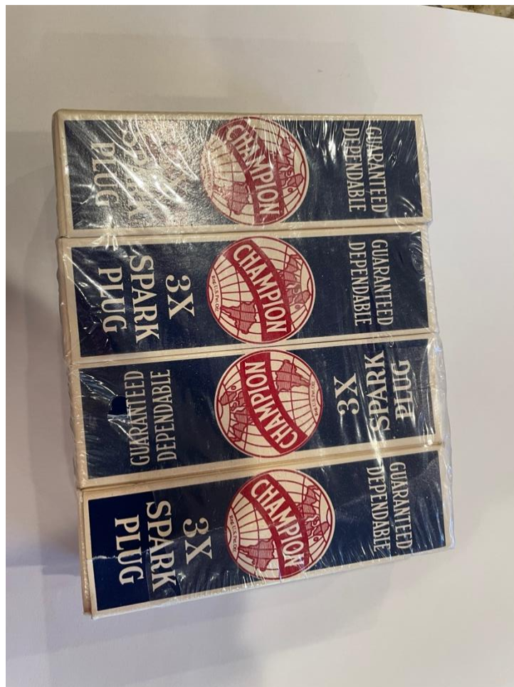
Reproduction Champion 3X plugs, note the word Guaranteed on the box.

Many sparkplugs will fit and work properly in the Model A, but there was a LOT of different vendors trying to take a share of the market. Champion still makes the 3X, but they are pricey. They range from $35 to $40 each from the vendors. If you're looking for a set of reproduction plugs the correct Champion number is 429.