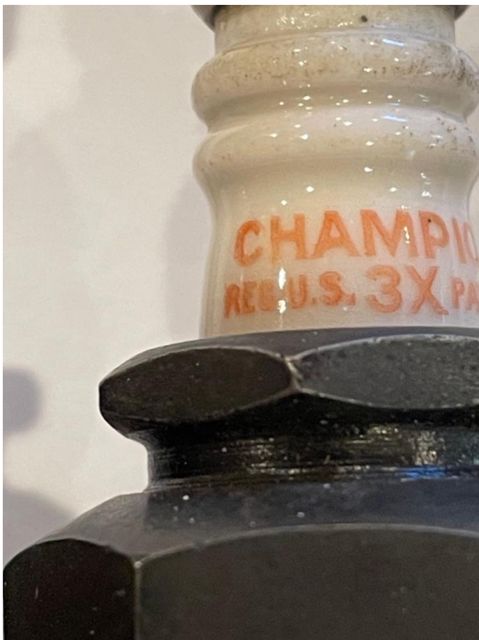
Shown is an original Champion 3X. Note the rounded top on the number 3.

Originals came with two colors of lettering on them, orange and red. The judging standards don't list any particular year the colors changed. The standards do also indicate the thickness of the font can vary.