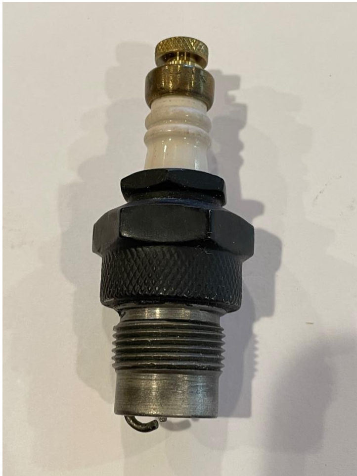
An original Champion 3X plug reconditioned by CL