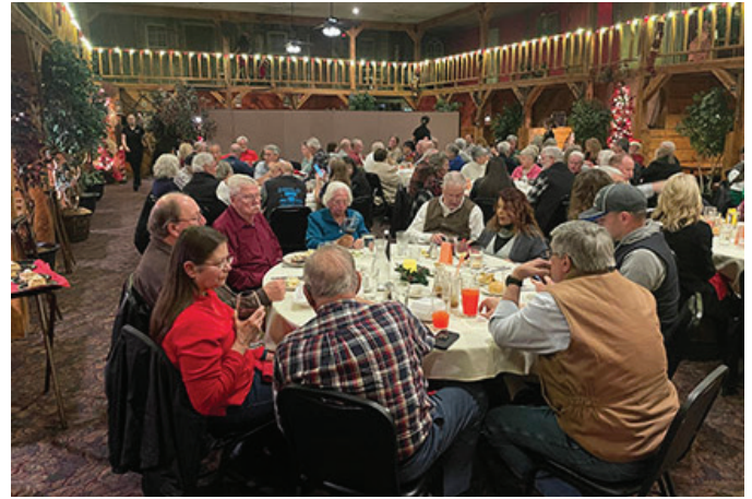
Above and below: The dining room at the Timbermine steakhouse was crowded with Model Aers at the Christmas Party