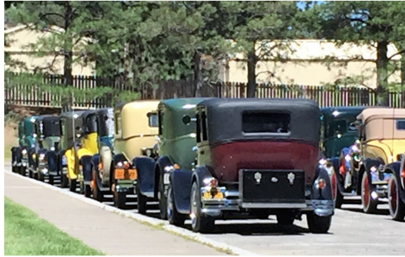
Day 4 The Grand Tour: Incline Village, Lake Tahoe, and to the Bowers Mansion.