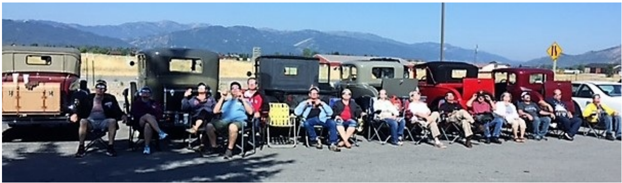
The Beehive A's await the total solar eclipse at a rest stop in Alpine, Wyoming