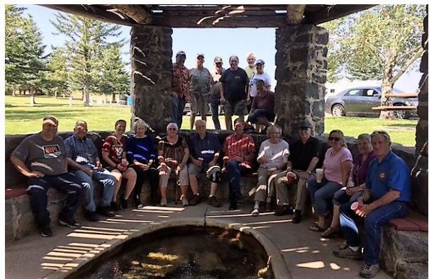
The gang at Hooper Springs

We had a fantastic trip up to Idaho/Wyoming to see the Eclipse! I was really worried about how my Model A would perform. You know they just don't run right without the hood, so I trailered mine up to Soda Springs. My worry, as it turns out, was unfounded. After we got to Soda Springs I unloaded my A and went up to Hooper Springs. I've gotta say, I am still tasting the metals in that water (yuck). However, mechanically my car had no troubles. The only issue was the carburetor. It wasn't working quite right. It was easily remedied by fiddling with the adjustment from within the cab. Next time, I will be more ready to drive it for the whole trip.