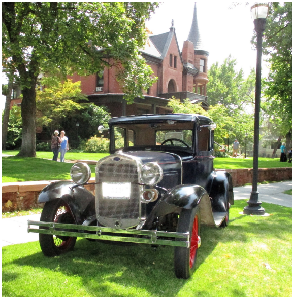
Kirk Clause had the prime display spot near the Eccles Art Center.