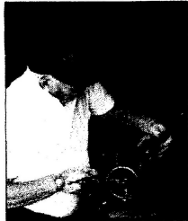
Red E. Power

In other words, the grease will keep the lubricating oil on the job.