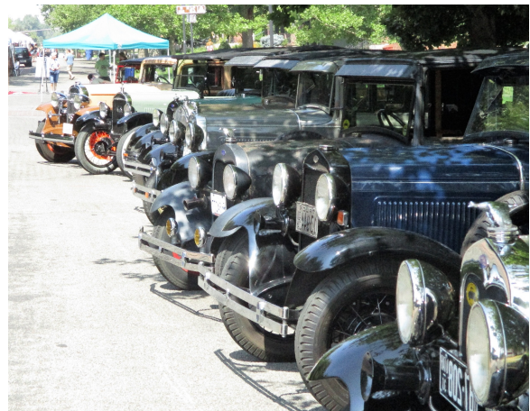
Ten Model A's and one 1932 Buick were represented at the event.