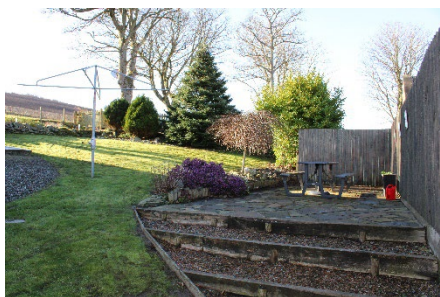
The garden slopes down to the patio

From the main garden to the terrace there is grass, gravel and 1 step to the patio area. Here there is a picnic bench. The table is 730mm high from floor to table edge. The bench height is 460mm. These are fixed seats with access points at either end.