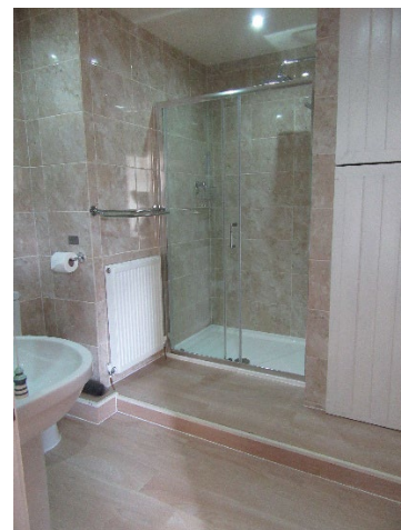
As seen from the bedroom