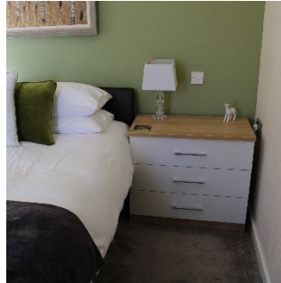
800mm Space to right of bed

Ensuite door opening into the shower room.