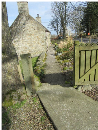
Access 3 steps down