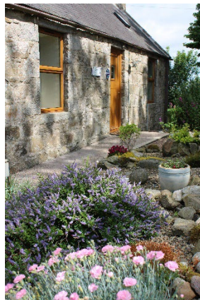
Slight incline towards front door