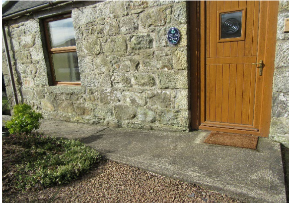
Path to Cottage entrance