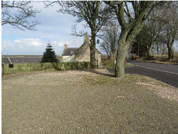
Parking space off road and adjacent to Buttermere Cottage