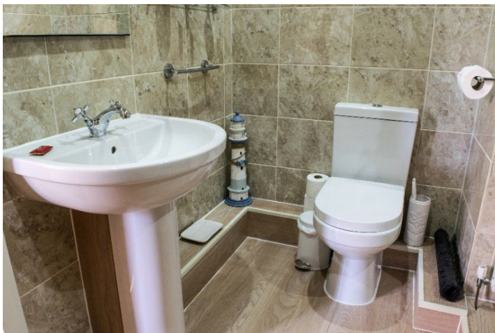
Master Bedroom Ensuite Shower Room