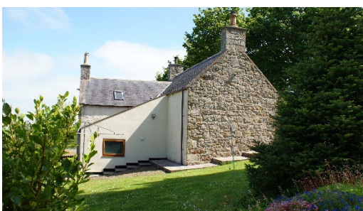
Steps down to the garden