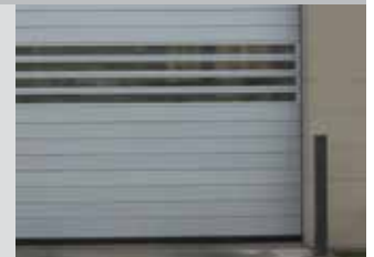
Solid and vision slats shown

Standard maximum sizes shown; larger sizes may be available upon request.