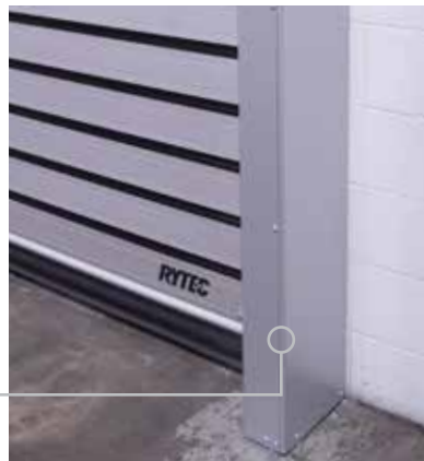
Low Profile Side Columns

With anodized aluminum slats that will not corrode, Rytec quality and durability can be counted on along with an appearance that will last for many years, even under the worst weather conditions. Also available are models designed with 9-inch tall full-vision (Spiral® LP-FV) or full-ventilation (Spiral® LP-VT) slats. Ideal for parking and other commercial, institutional and residential applications.