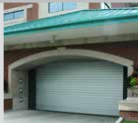
Spiral® door with solid slats