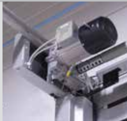
Variable speed motor