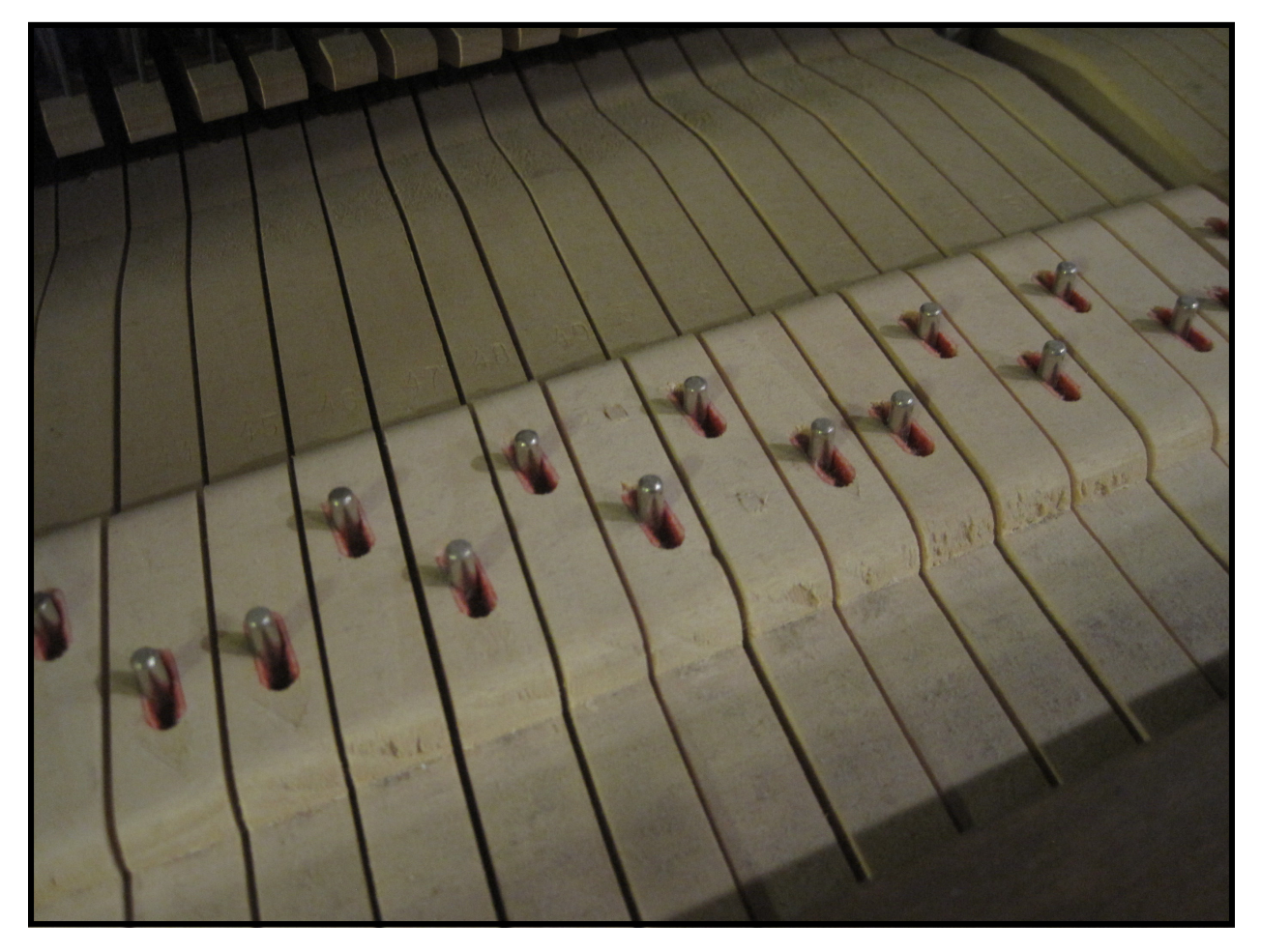
A console piano gives the advantage of full-length keys.