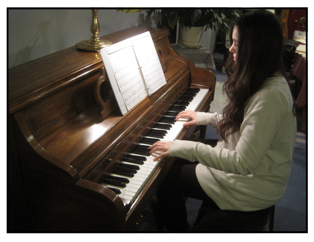
A freshly tuned console piano provides an enjoyable playing experience for beginners and accomplished pianists alike!

As an owner of a console piano you have the privilege of playing an instrument that is capable of providing very good performance and sound while occupying no more of your valuable floor space than a spinet piano. With proper maintenance, a good quality console piano will be a delight to play, providing a responsive touch and a commendable tone.