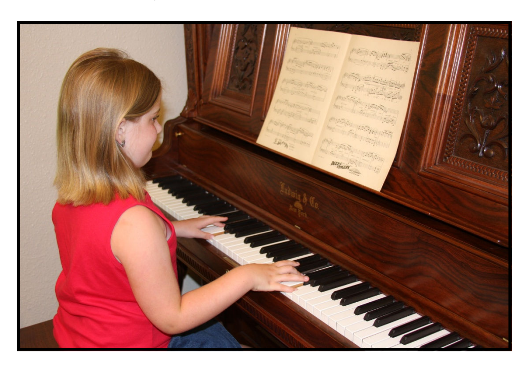
Sitting down to play on a freshly tuned upright piano is a wonderful experience for performers of all ages and ability levels!

As an owner of a vintage, upright piano you have the privilege of playing music on an instrument that was built around the same time that the first Model T Fords were roaming the countryside! With proper maintenance, upright pianos a century old or even older may be enjoyed daily, and have the potential to perform and sound as beautiful as the day they were built. "Planned obsolescence" was definitely not an idea that had occurred to the builders of these wonderful instruments! They were built to last!