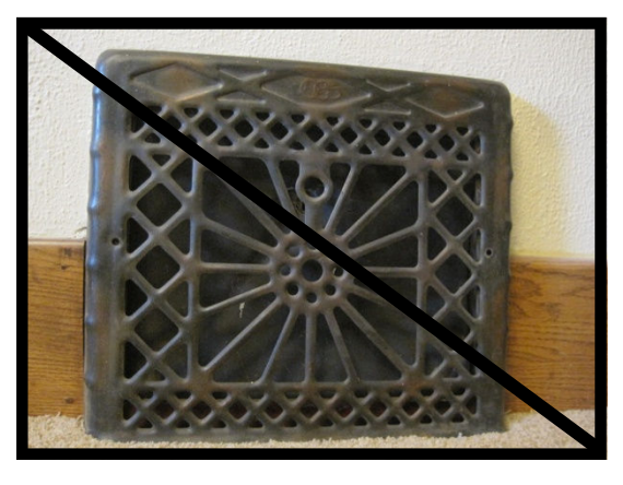
1. Hot air registers—dry, heated air blowing directly on the back of a piano is particularly bad for the soundboard.

Environment: While tuning, repairs, regulation and voicing are the job of the technician, seeing to it that your upright piano is placed in an appropriate spot within your home is up to you. What is needed, as much as possible, is a location where temperature and humidity are kept at moderate levels year-round. Drafty locations, or areas where wide swings in either temperature or humidity occur (unheated porches, moldy basements, etc.) are unsuitable for a piano. In particular avoid placing your piano in front of either of the following: