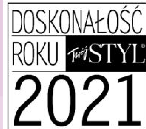
EXCELLENCE OF THE YEAR 2021 TWÓJ STYL magazine for SORAYA Kombucha