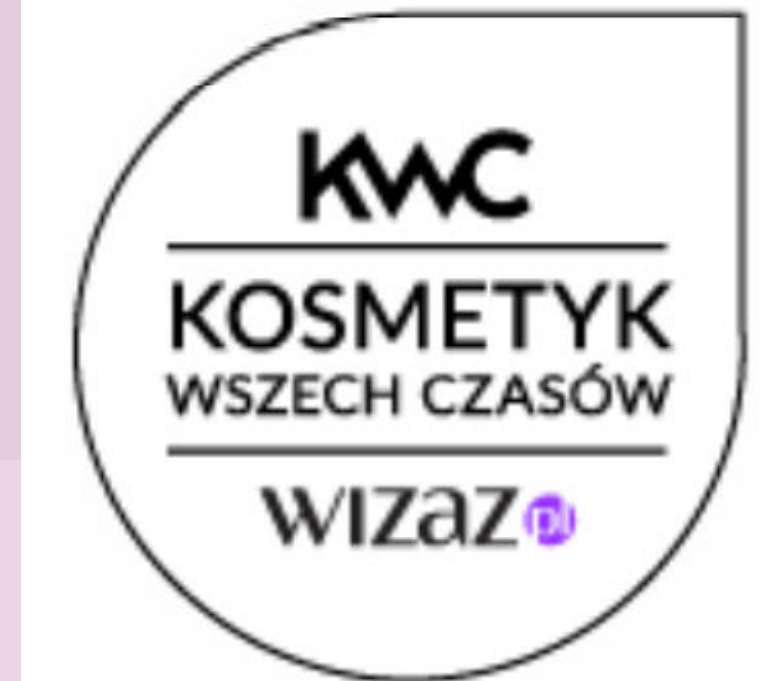
COSMETIC OF ALL TIMES WIZAZ.PL portal for SORAYA Plante .