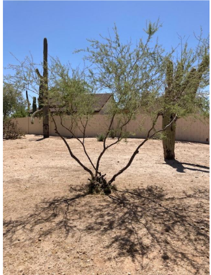
Another volunteer bush landscapers shaped and reared into a tree