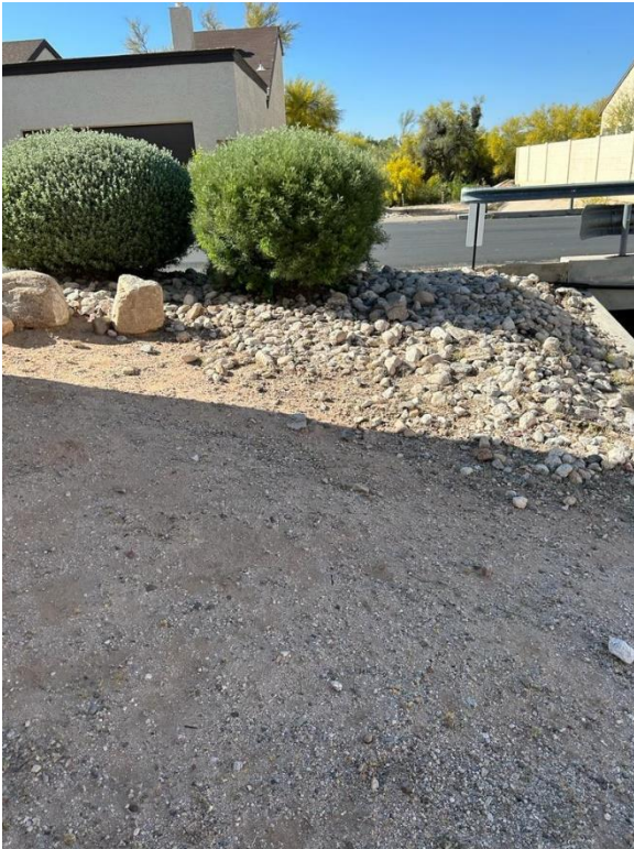
AFTER cleanup (corner bridge at Matilda)