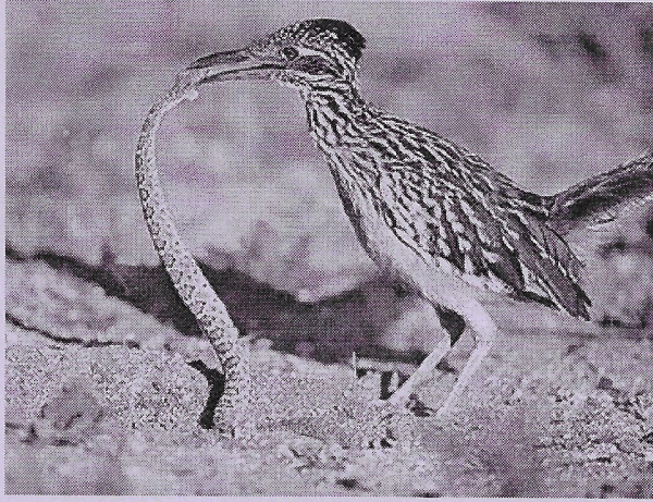
Roadrunner killing Rattlesnake in Desert

April is the start of Rattlesnake season. Remember to please be careful when walking in the desert and in your yards. Never leave pets unattended, especially in yards along the wash. If you spot a rattlesnake in your yard call 911 - do not try to remove it yourself.