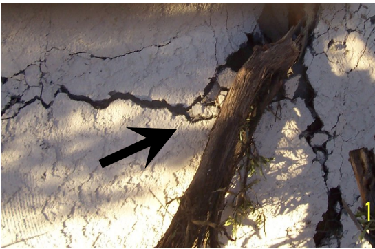
Tree branch embedded into exterior wall from impact