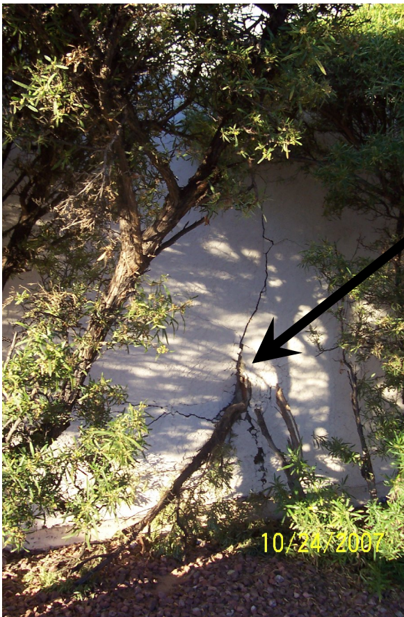
Impact at Exterior wall of home at 8876 Joanna caused large cracks and embedded branch into exterior wall