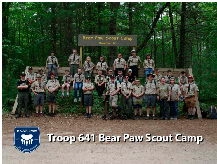
Troop 641 Bear Paw Scout Camp

We are offering additional copies of the photo to parents, Scouts, and Scout Leaders. Photos will be ready for the unit leader to take upon check-out. Photos can be paid for with your order or at camp. 8x10s are $6.00, 5x7s are $4.00.