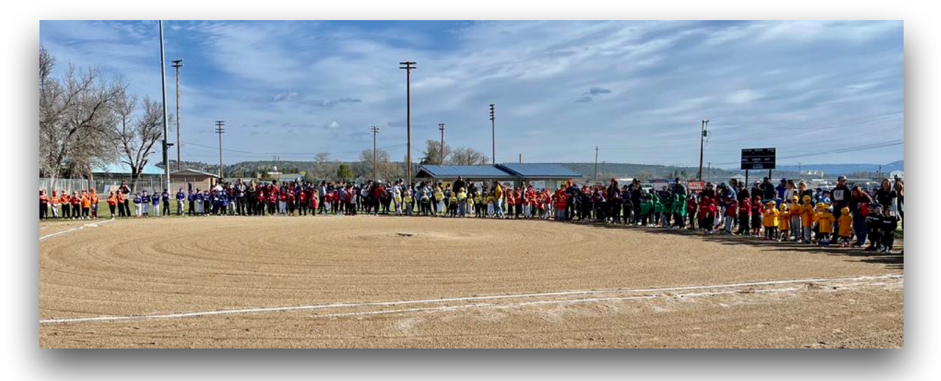
Play Ball ! Opening day of Modoc Little League ! So many ballplayers!!