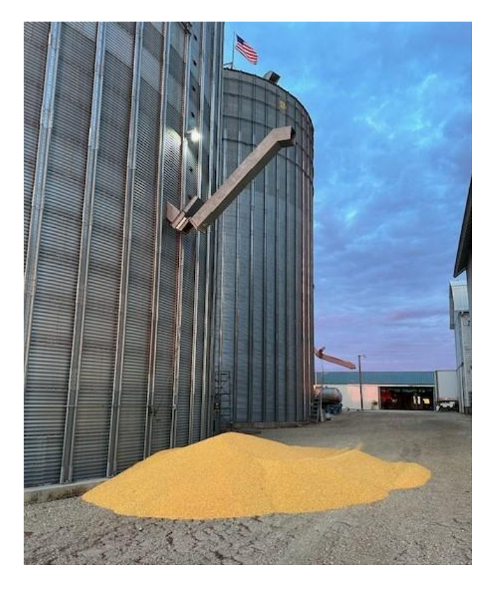
Oops! Helps when Roger closes the slide valve.