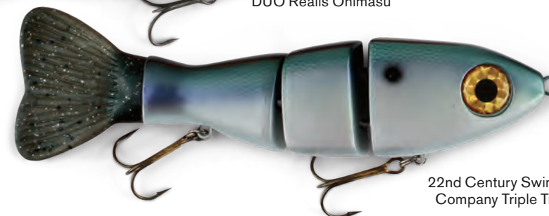
22nd Century Swimbait Company Triple Trout