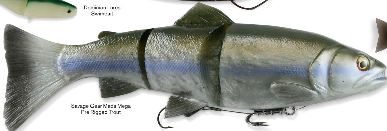
Savage Gear Mads Mega Pre Rigged Trout