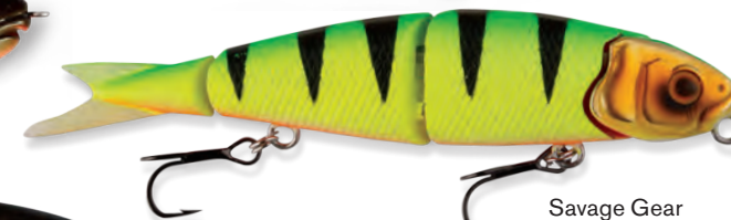
Savage Gear 4Play Herring Swim & Jerk