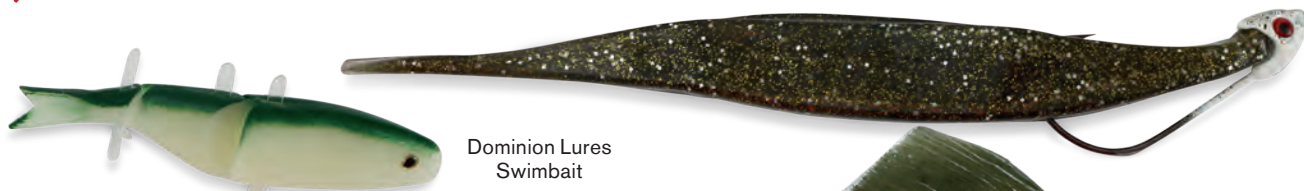
Mann's Bait Company Reel 'N Shad (3.75-inch and Monster)