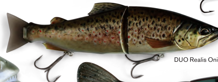
DUO Realis Onimasu