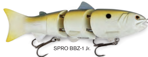
SPRO BBZ-1 Jr.