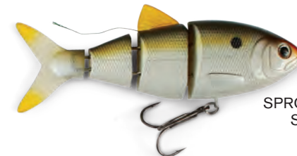
SPRO BBZ-1 Shad