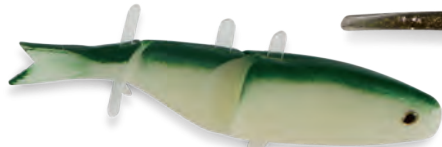
Dominion Lures Swimbait