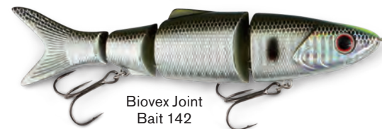
Biovex Joint Bait 142