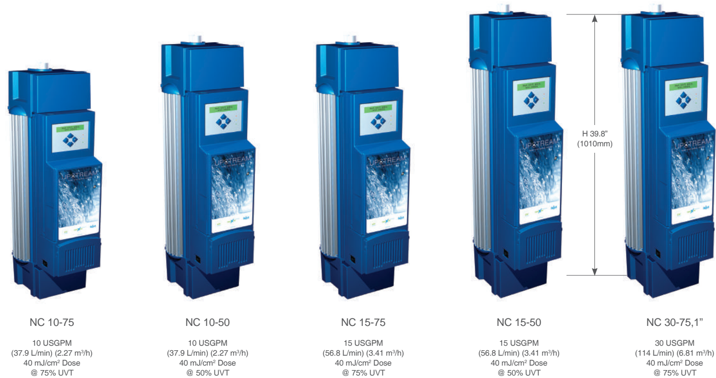
NC 10-75 10 USGPM (37.9 L/min) (2.27 m³/h) 40 mJ/cm² Dose @ 75% UVT NC 10-50 10 USGPM (37.9 L/min) (2.27 m³/h) 40 mJ/cm² Dose @ 50% UVT NC 15-75 15 USGPM (56.8 L/min) (3.41 m³/h) 40 mJ/cm² Dose @ 75% UVT NC 15-50 15 USGPM (56.8 L/min) (3.41 m³/h) 40 mJ/cm² Dose @ 50% UVT NC 30-75,1" 30 USGPM (114 L/min) (6.81 m³/h) 40 mJ/cm² Dose @ 75% UVT