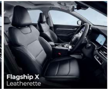
Flagship X Leatherette