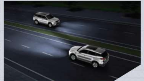
Intelligent High Beam Control (IHBC)