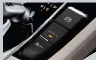
Auto Brake Hold