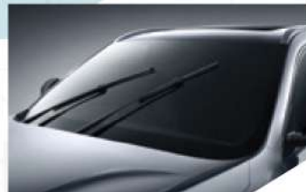
Auto Rain Sensing Wipers