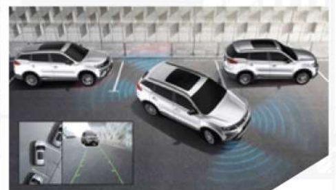
360 Camera with 3D Display