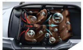
Air Purifier System