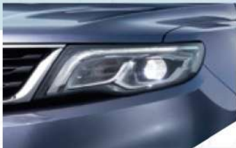
LED Headlamps with Daytime Running Lamps