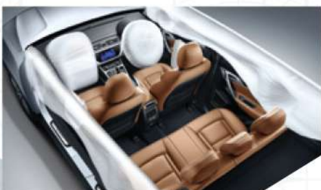
6 SRS Airbags

INTELLIGENTLY SAFE Intelligent technology provides uncompromising safety for a confident drive always.