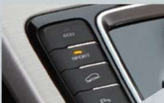
Drive Mode Selection