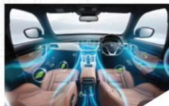
N95 Cabin Filter