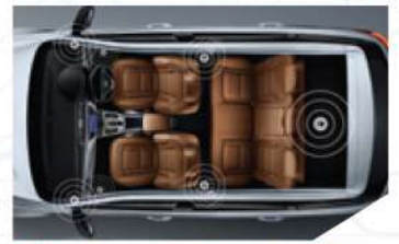
9 Speakers with Power Amplifier and Subwoofer