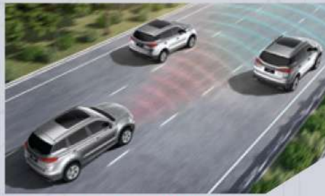
Adaptive Cruise Control (ACC)