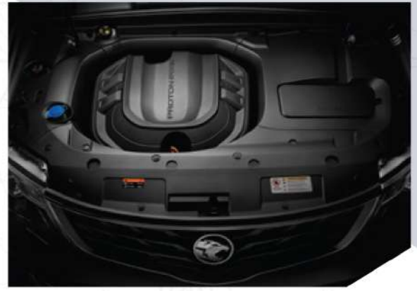
1.5L TGD Engine