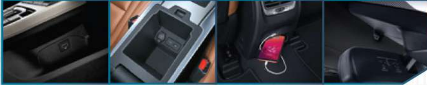
6 USB Ports