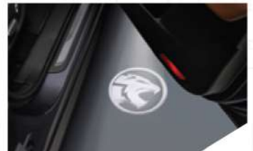
Front Welcome Lamps