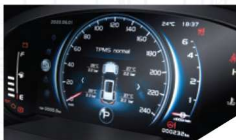
Tyre Pressure Monitoring System (TPMS)