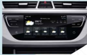
Online Music Streaming and Weather Forecast