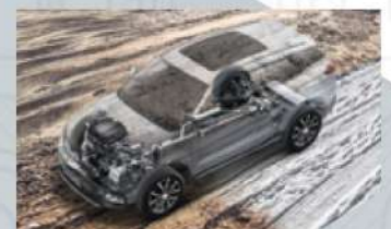
Intelligent All-Wheel Drive