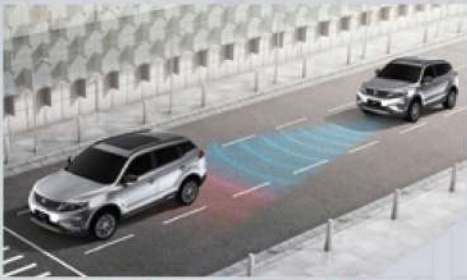
Autonomous Emergency Braking (AEB) and Forward Collision Warning (FCW)

9 advanced sensors and 5 cameras constantly working to sense and react to what you might not have, keeping you and your loved ones safe. ADAS safety features are not a substitute for safe and attentive driving. Driver remains responsible for safe vehicle operation at all times.