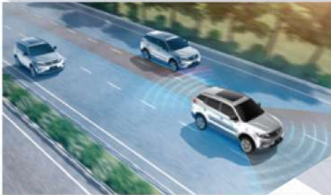
Blind Spot Information System (BLIS)