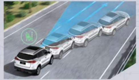
Lane Departure Warning (LDW)