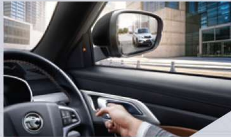
Door Opening Warning System (DOW)