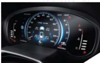
LCD Meter Combination