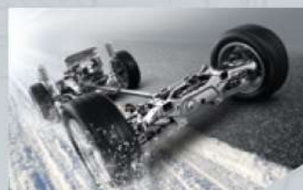
Ride and Handling