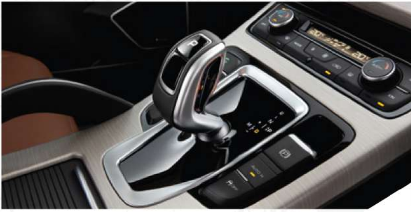
7-Speed Dual Clutch Transmission with Manual Mode