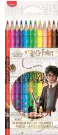
Ref 832053 Decorated color pencils x12 Crayons de couleurs decorees x12