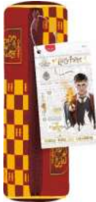
Réf. 934802 Pencil case - Trousse