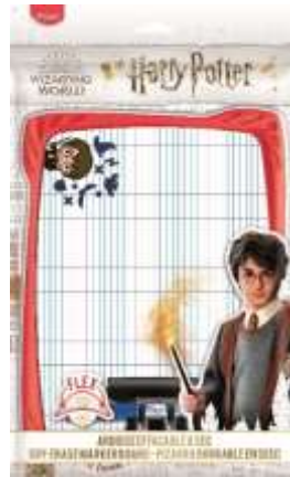
Réf. 583500 Whiteboard – Tableau Blanc