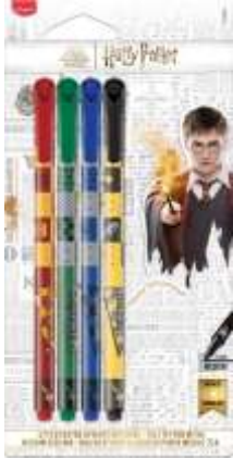
Réf. 749600 FINELINER MEDIUM X4 FEUTRES POINTE MEDIUM X4 COULEURS ASSORTIES