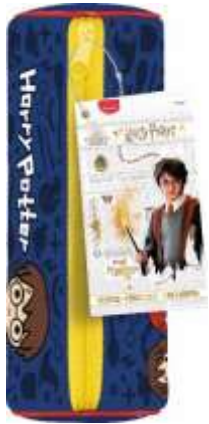
Réf. 934801 Pencil case - Trousse