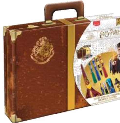
Réf. 899798 Multi Product Box Coffret multi-produits