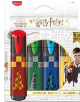
Réf. 740701 SURLIGNEURS / HIGHLIGHTERS X4