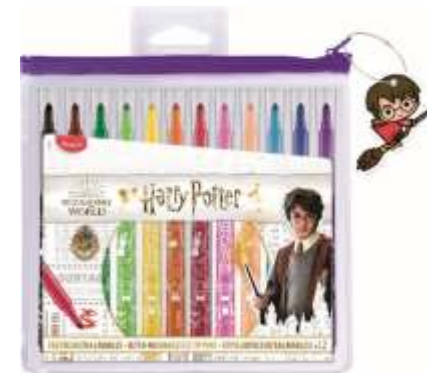
Réf. 845001 Long life color marker x12 reusable zip case Feutres long life decorees x12 pochette reutilisable