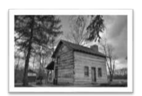
The Log Cabin & The GTHS School of Blacksmithing, Goshen Heritage Center 6767 Goshen Rd. Goshen OH (next to Goshen High School)