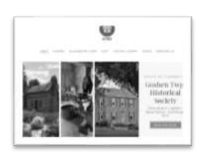
www.GoshenHistory.org Facebook@ Goshen History, Memories of Goshen, or GTHS School of Blacksmithing