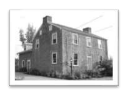
"The Anchorage" 1843 St Rt 28, Goshen OH