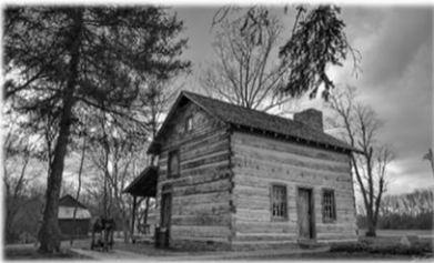
Cook Log Cabin Heritage Center & GTHS School of Blacksmithing