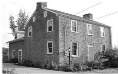
Historical Society Museum "The Anchorage"