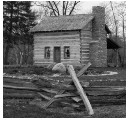
Split rail fencing at the Cook Log Cabin

A split-rail fence or log fence is a type of fence constructed in the United States and Canada, made from timber logs, usually split lengthwise into rails, and typically used for agricultural or decorative borders. Due to this style fence's meandering layout, it is also historically known as a zig zag fence, worm fence or snake fence. It was widely favored by pioneers because it required few nails (a luxury item in the 18 th and early 19 th centuries) and no digging was required for post holes. Split rail fencing could be built from nearby materials and erected on hard, uneven ground.