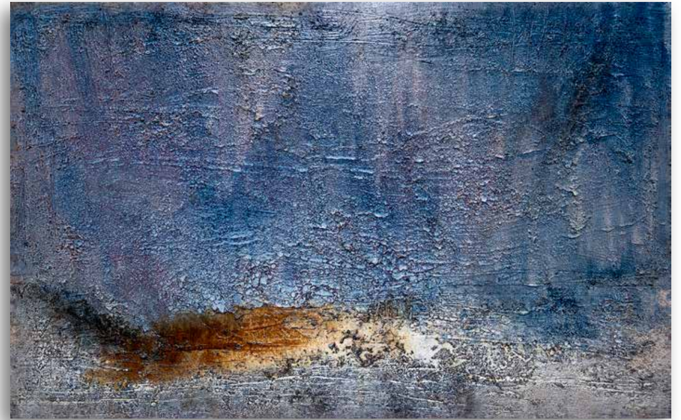
Rama's Bridge 68x108 inches