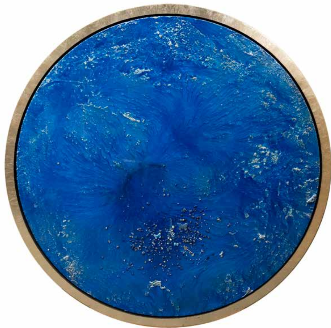
The Blue Lotus and the Butterfly 47 inch diameter framed