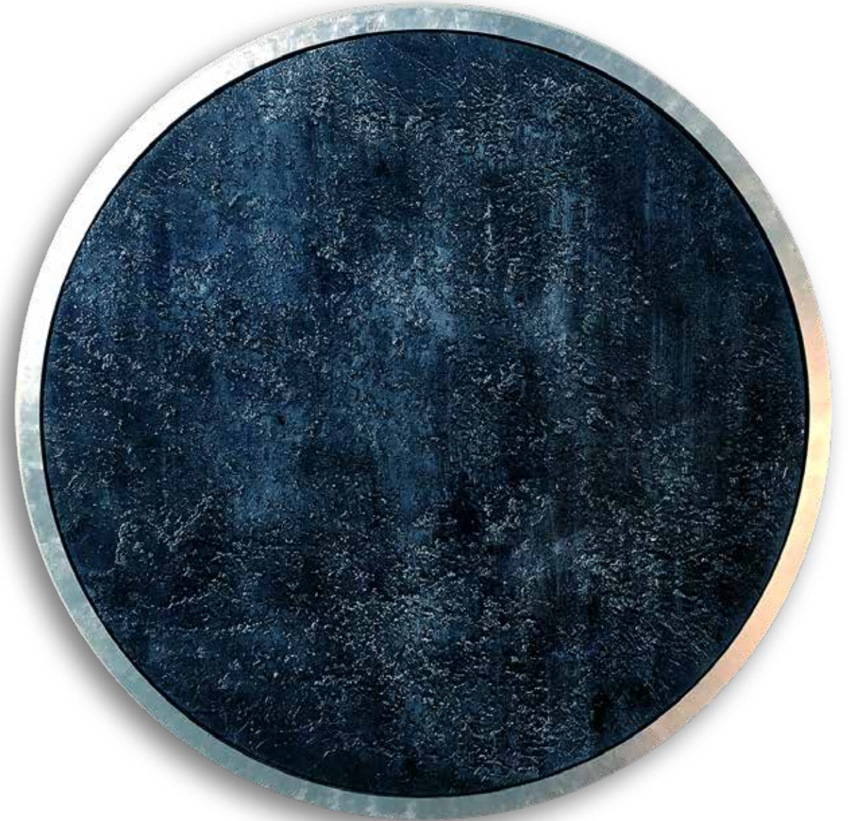
Do Not Swear by the Moon 75 inches diameter framed