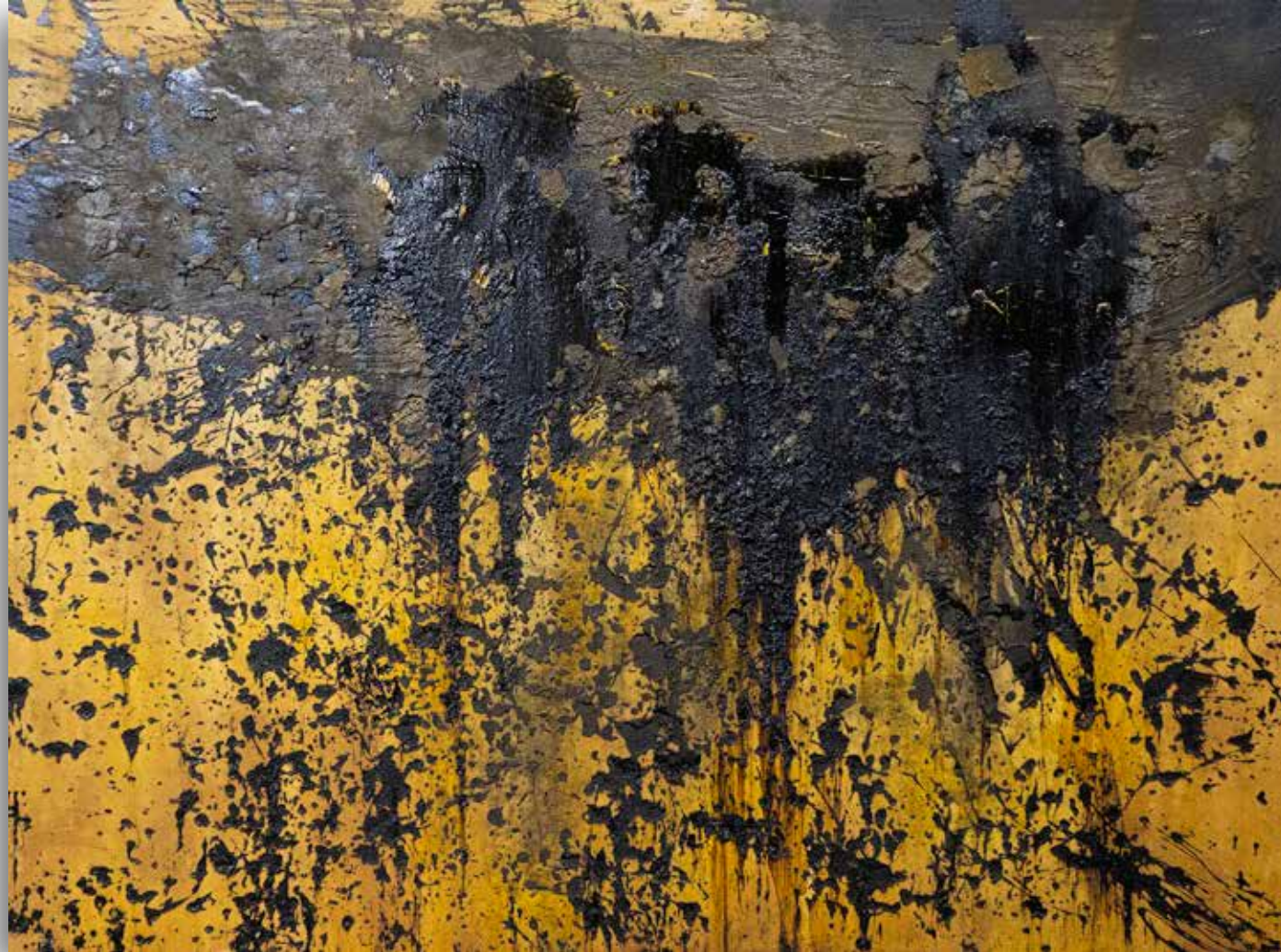
I Dream of Africa 66x88 inches