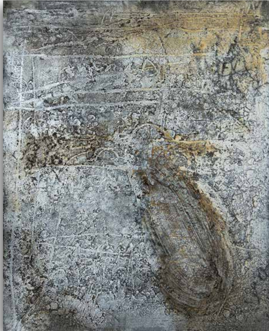
The Caves of Ajanta Part I&II 43x35 inches each