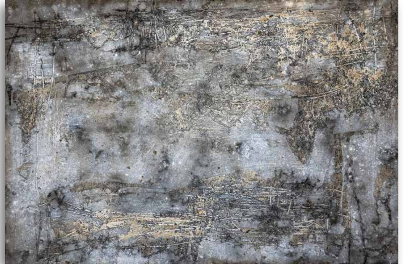
The Simpson Rule 60x90 inches