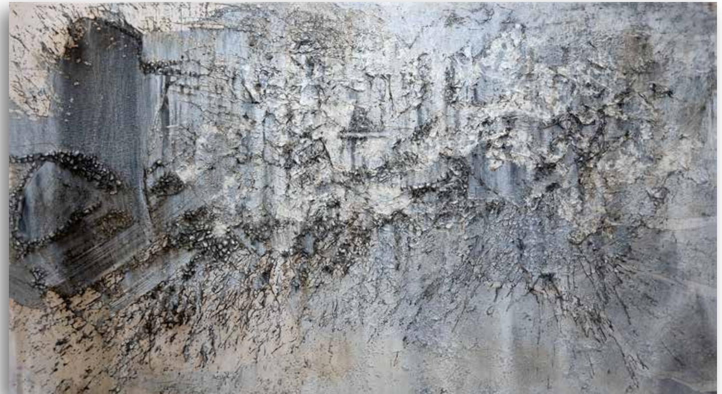
Liquid Imagination 70x120 inches