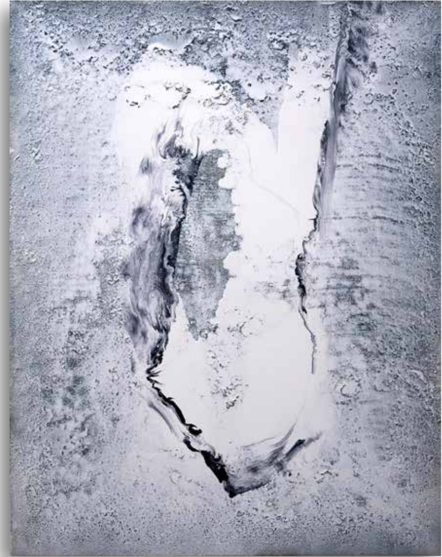
Athena 68x52 inches