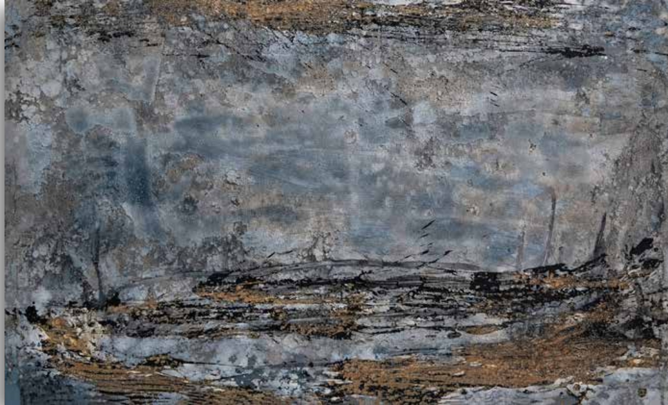
Mystery of the Blue Lotus 46x76 inches