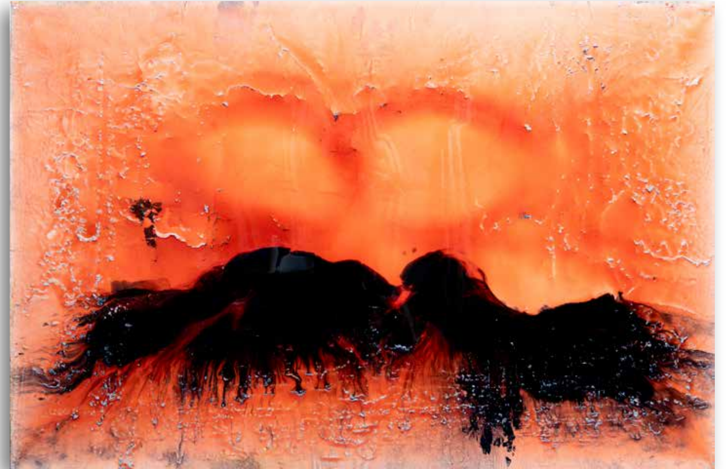
The Coral Sunset 60x90 inches