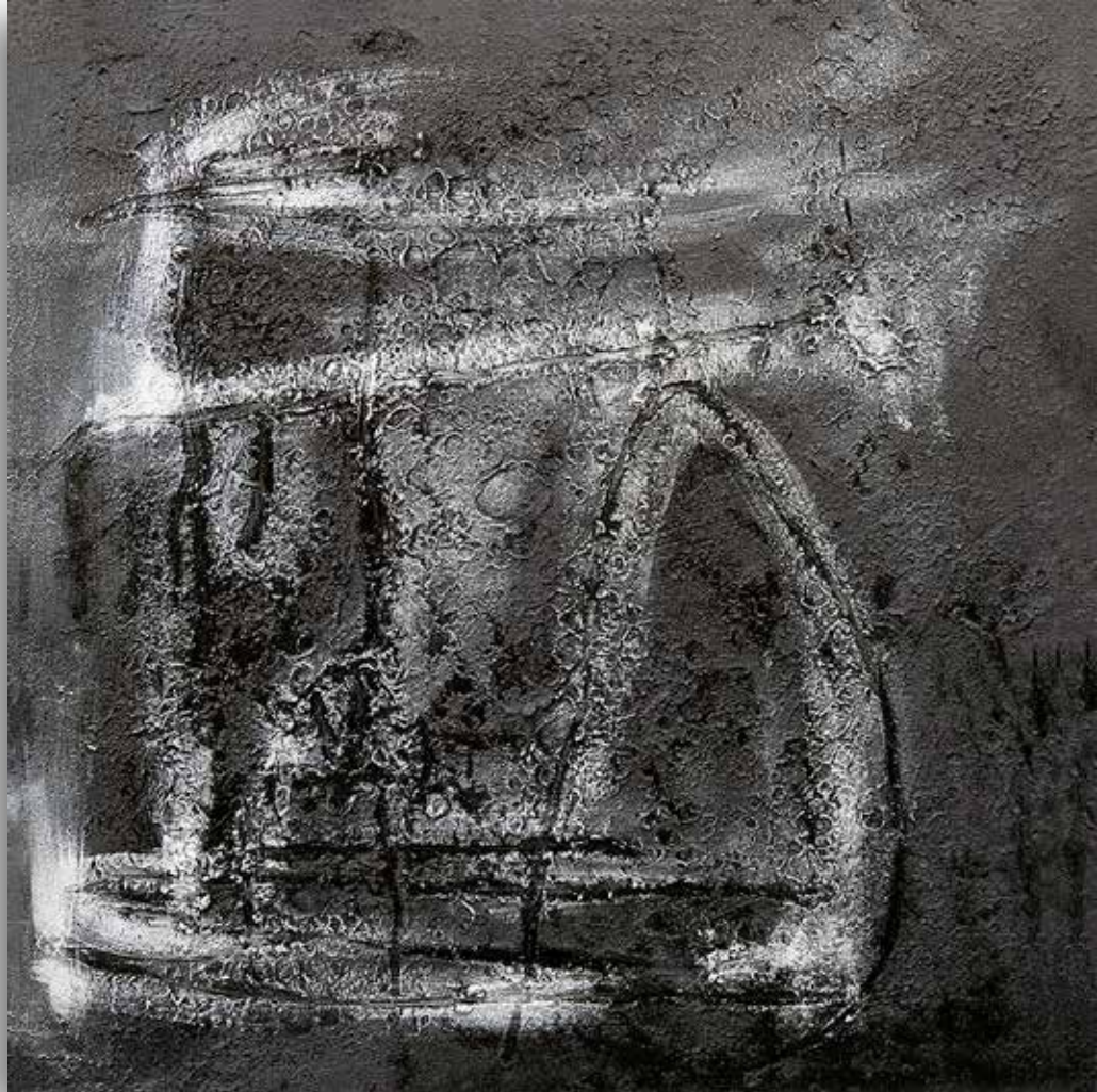
The Blizzard Stone Part I 43.5x43.5 inches each