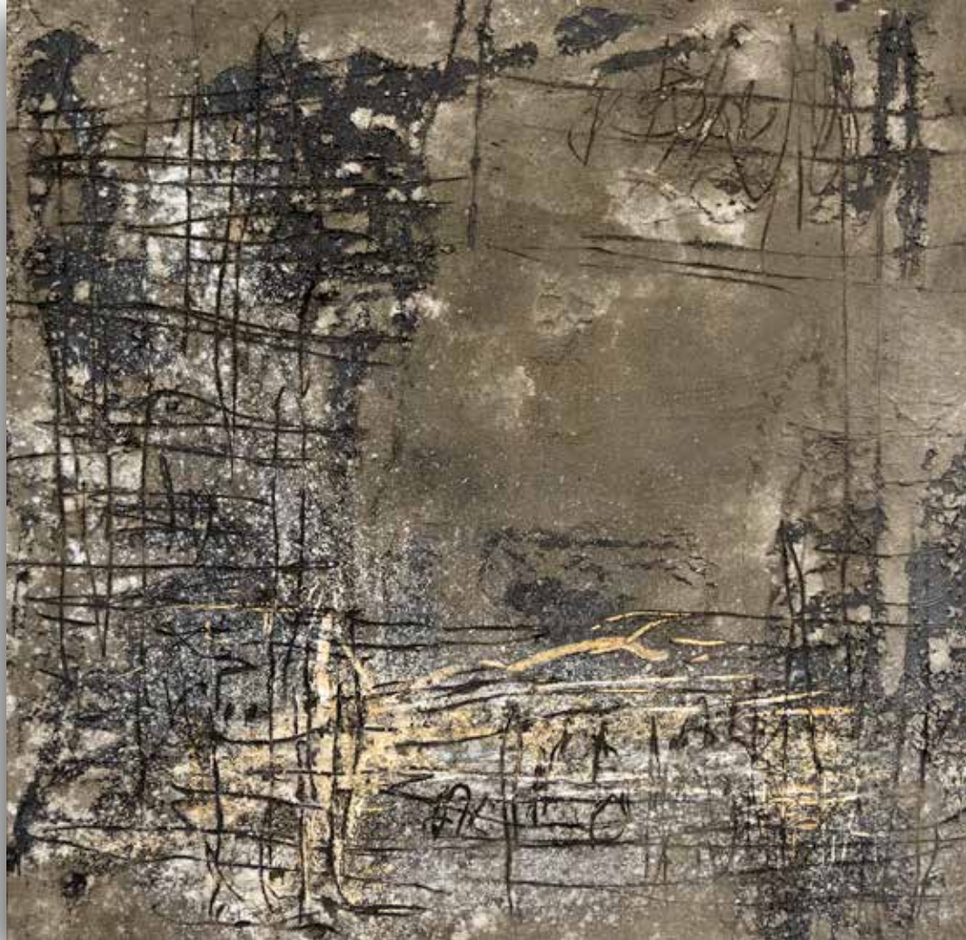
Simpsons Paradox 60x60 inches