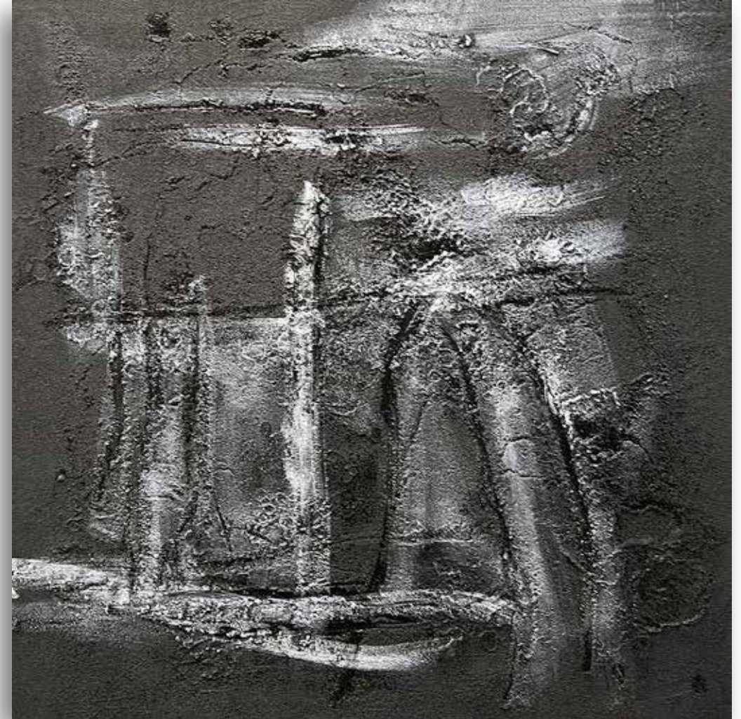
The Blizzard Stone Part II 43.5x43.5 inches each