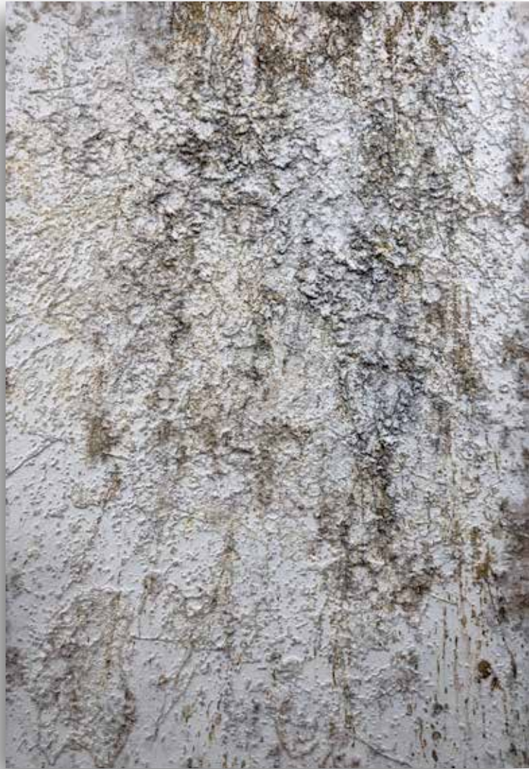
Anatoila 72x48 inches