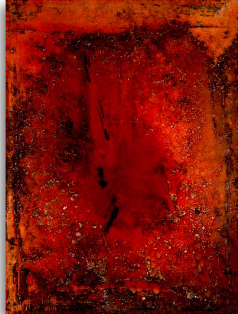
The Variscite Stone 46x34 inches