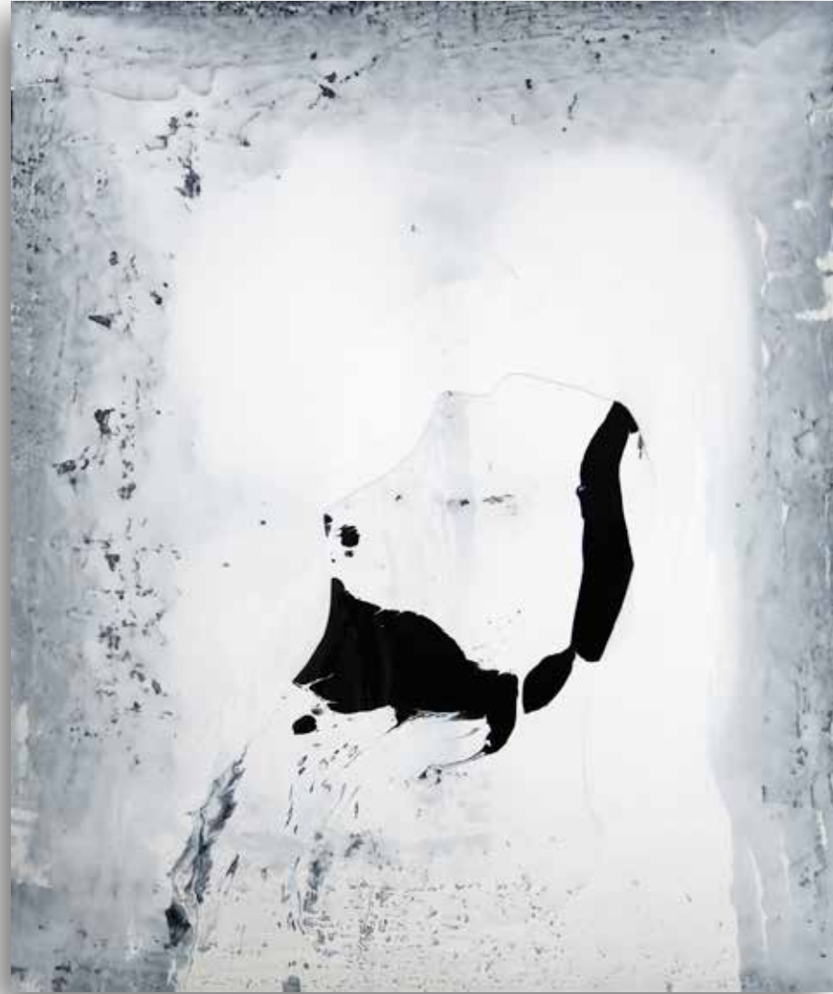
The Silent Circle of Peace 72x60 inches