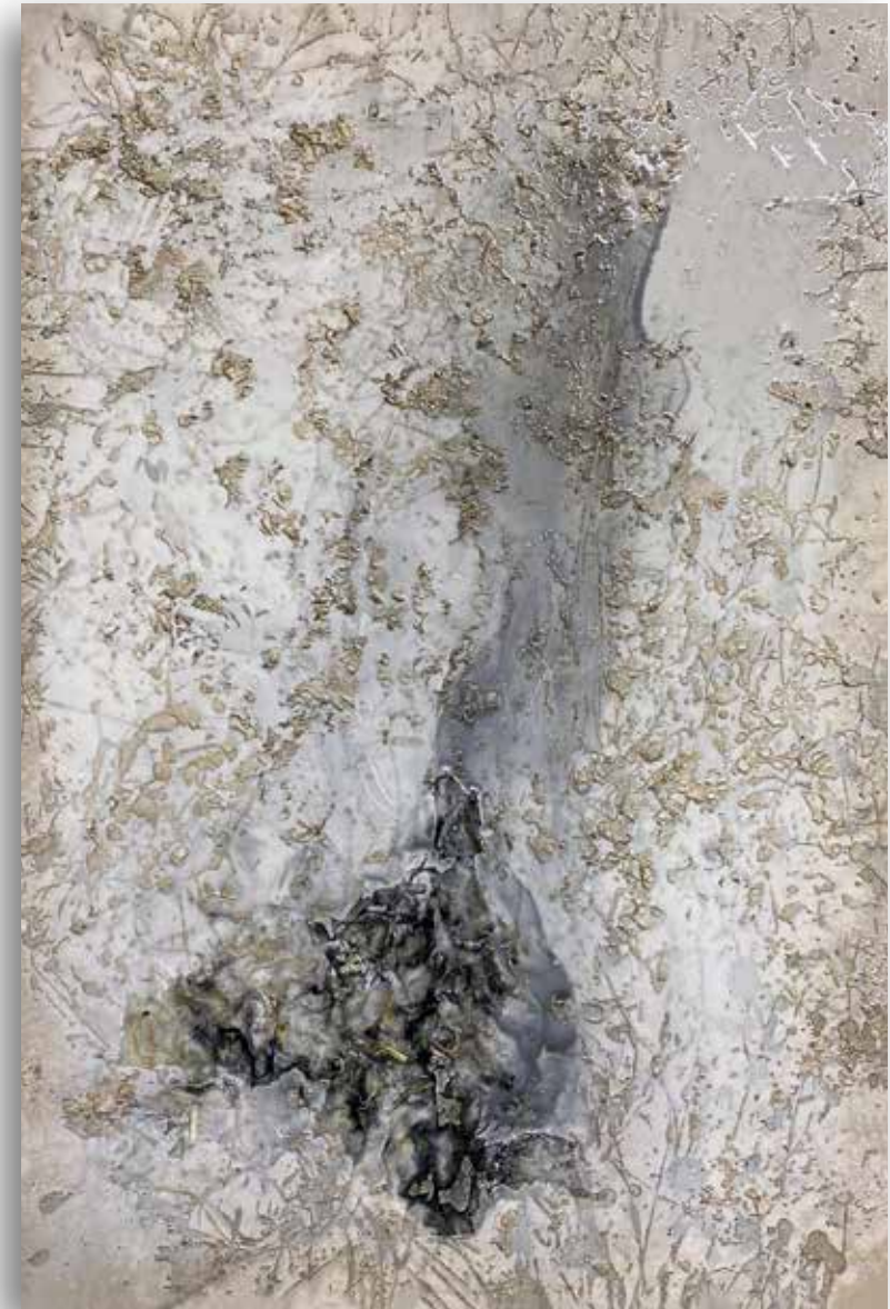
Ciudad Blanca 60x90 inches