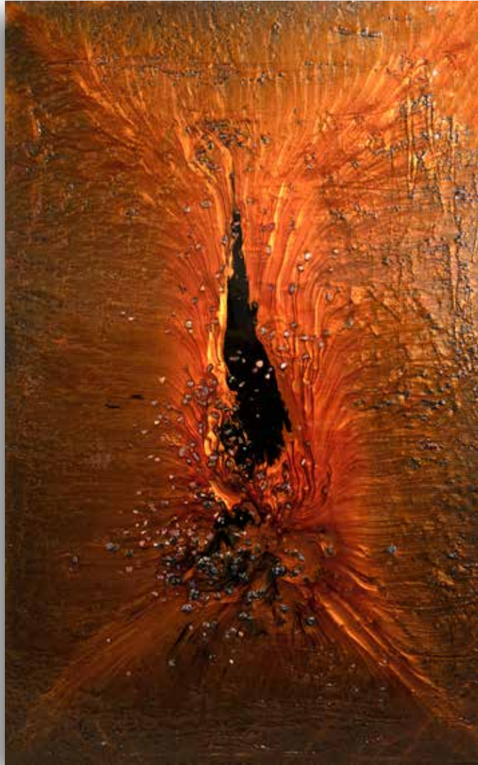
Raging Fires of the Sun 66x43 inches