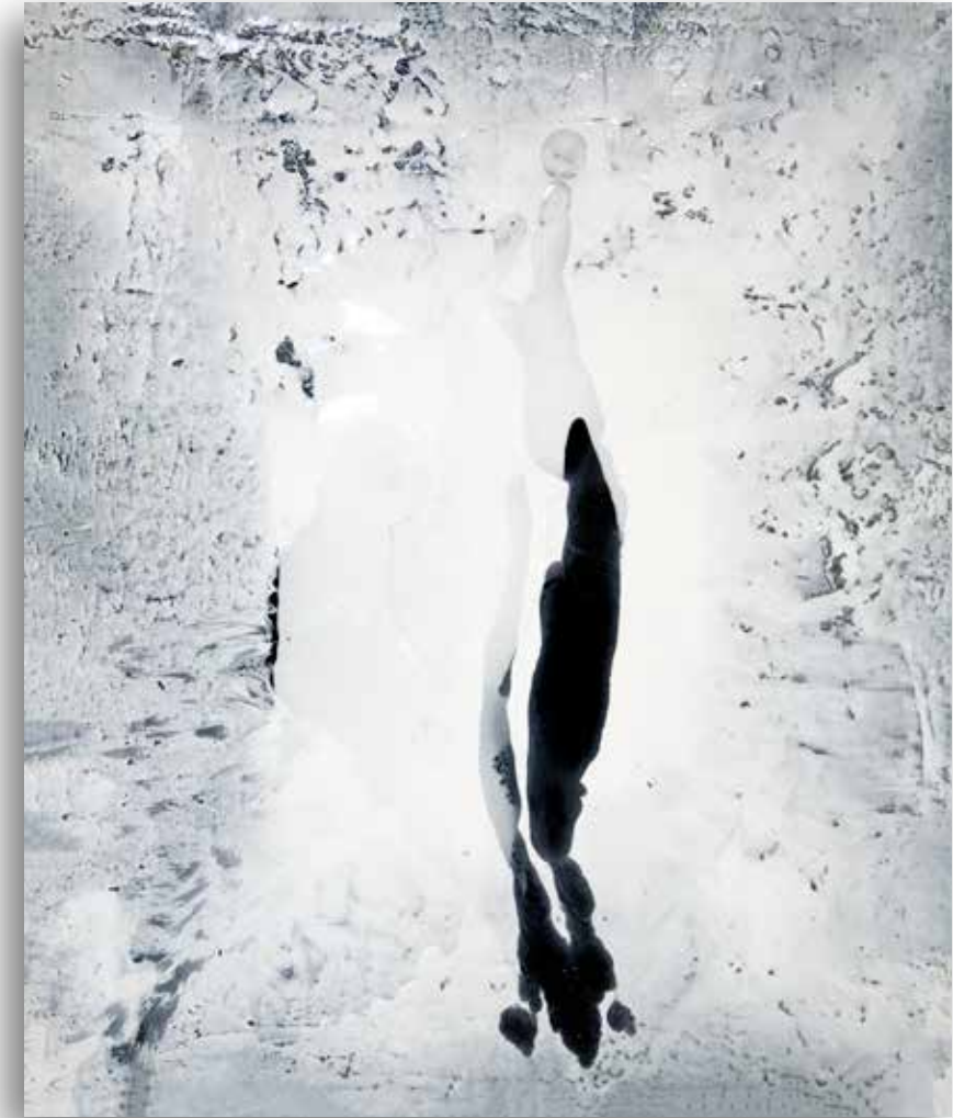
Diotima of Mantinea 60x50 inches