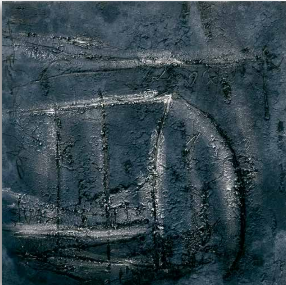
The Ishtar Gate 43.5x43.5 inches