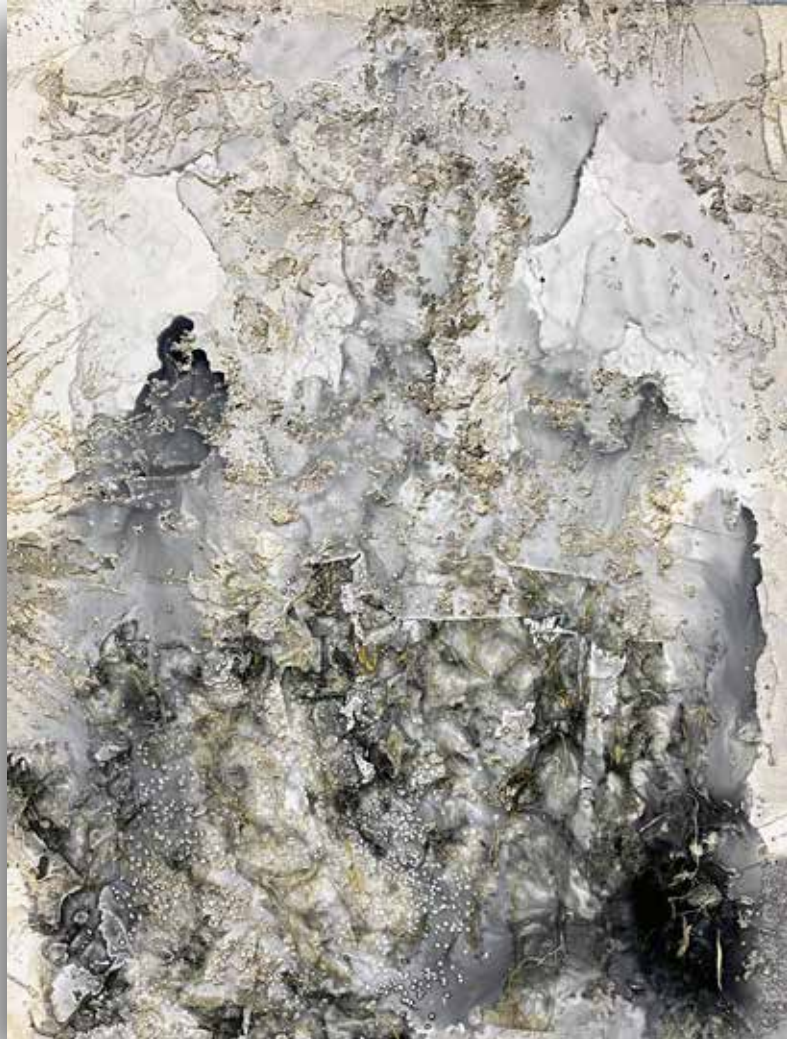
Gracias a Dios 70x50 inches