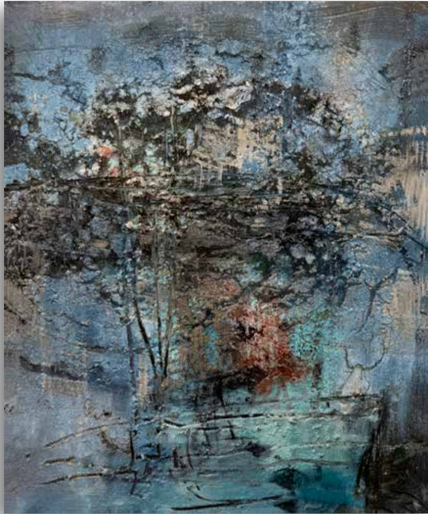
Mohenjo-Daro 43x35 inches