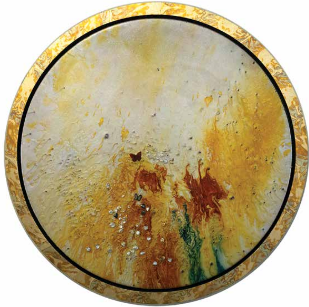
The Golden Butterfly 32 inches