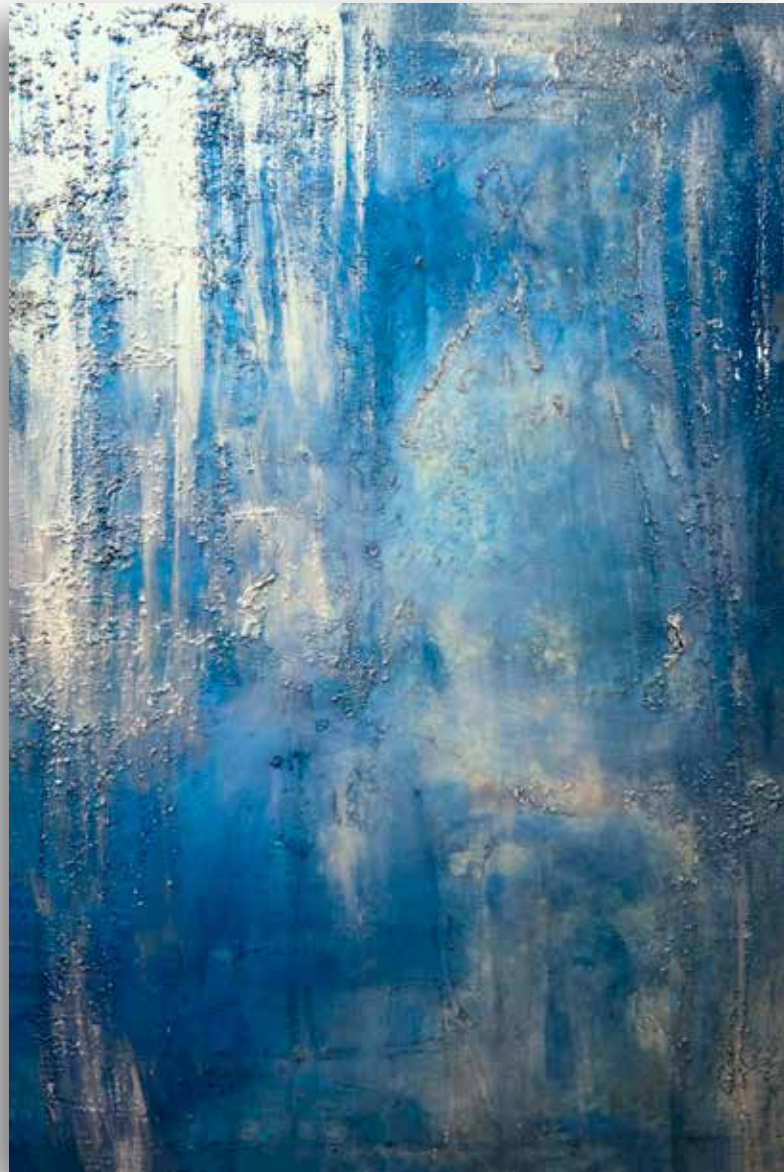
Atlas Obscura 90x60 inches