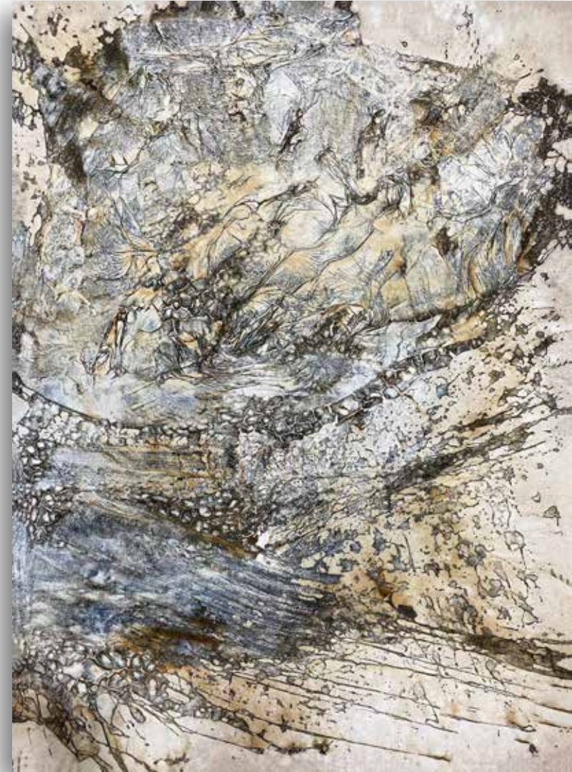
The Blue Phoenix 70x50 inches