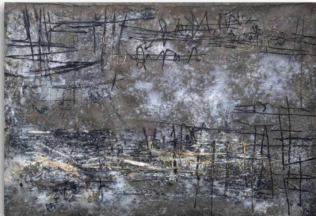
The Unsolvable Equation 70x100 inches