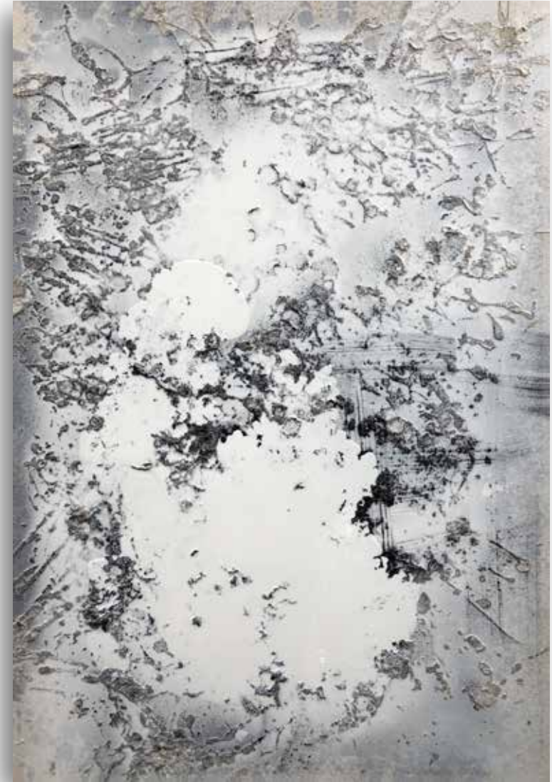
The Poem is a Dream 72x48 inches