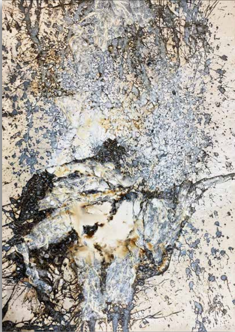
Liquid Underground 72x48 inches