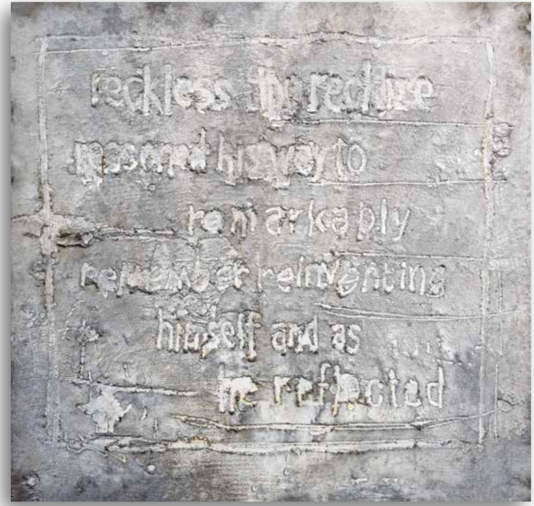
Reckless the Recluse 72x76 inches each