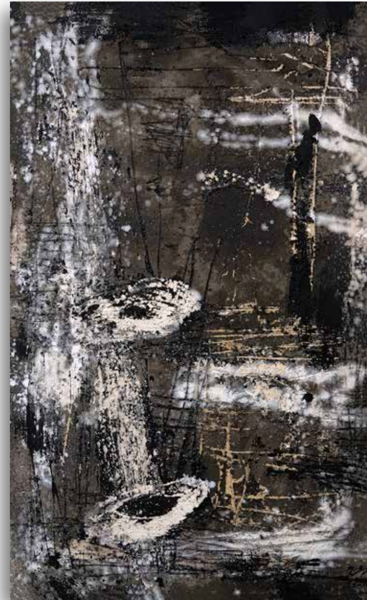
The Adjacent Positive 70x42 inches