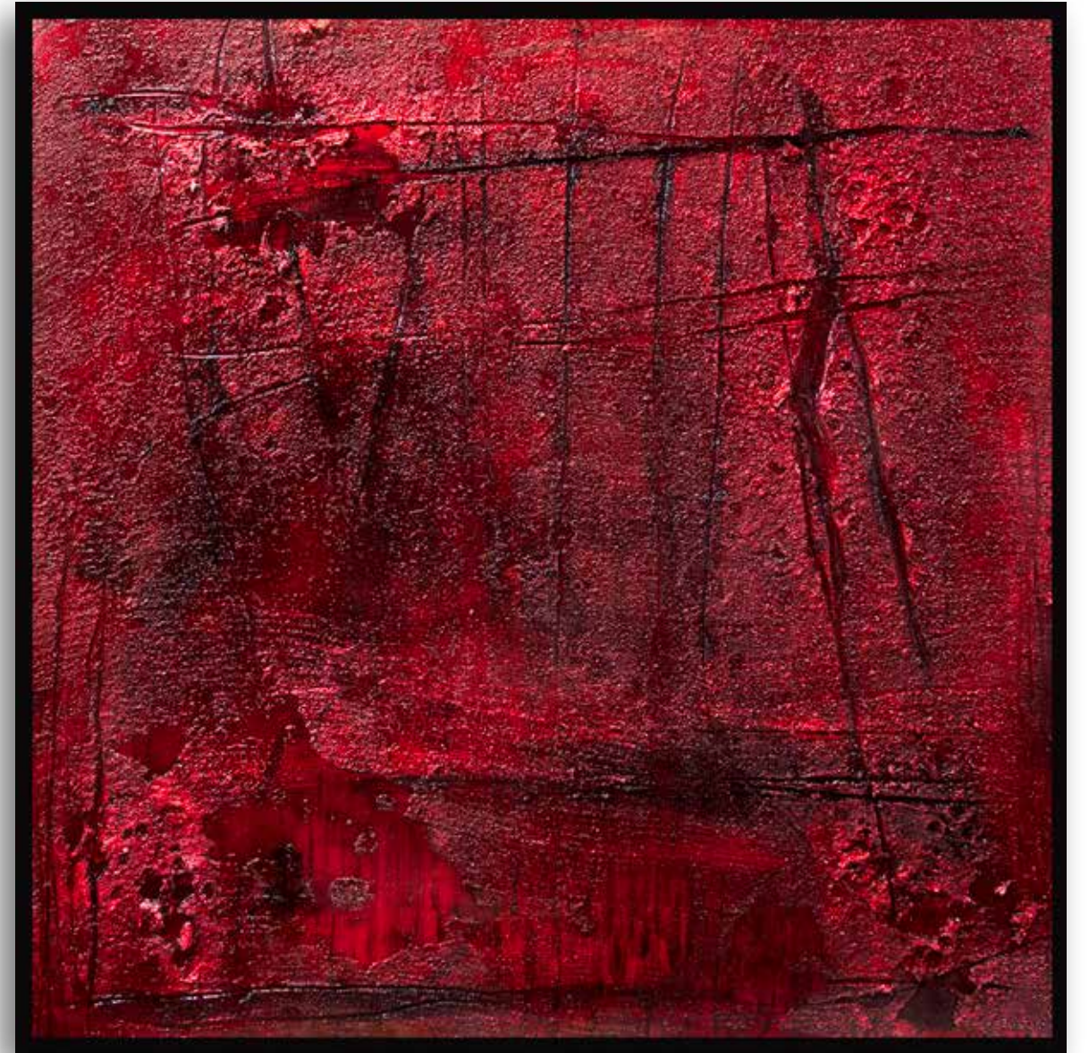
Kermes Vermilio 46x46 inches framed