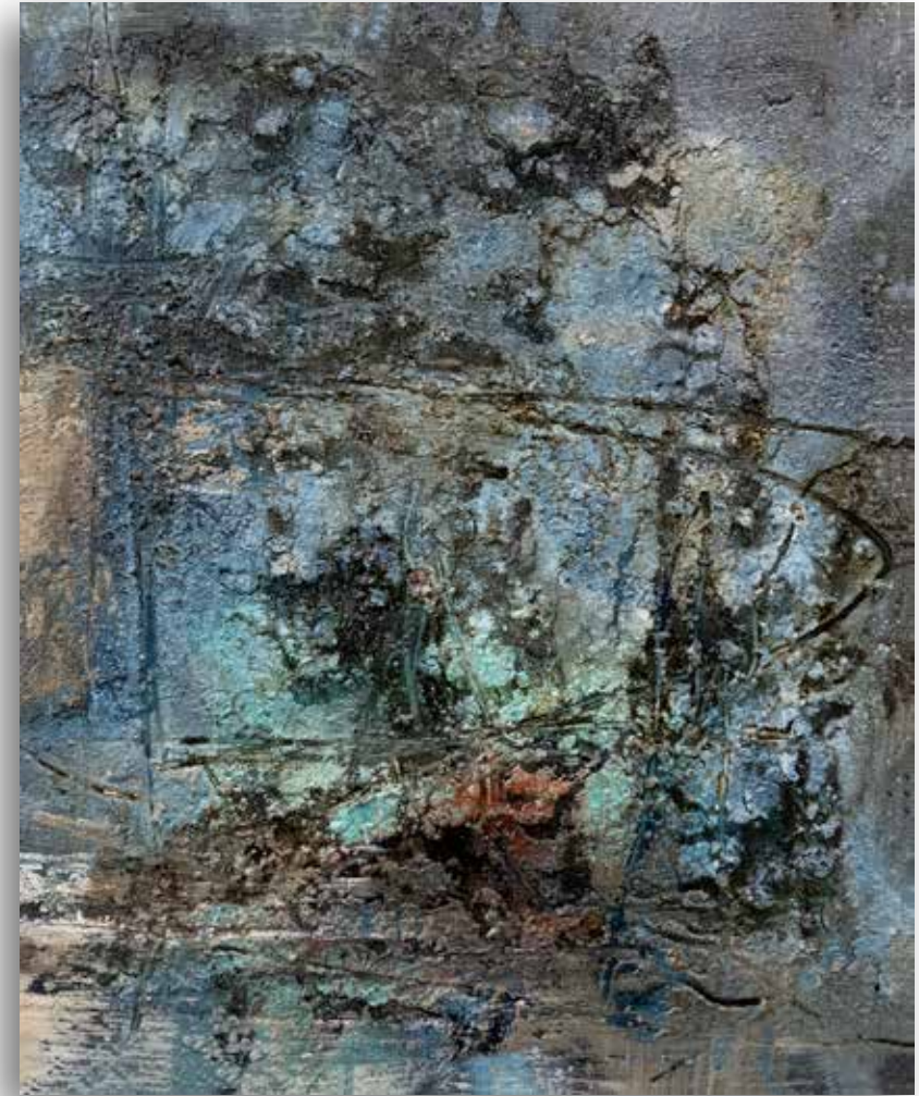
Harappa 43x35 inches