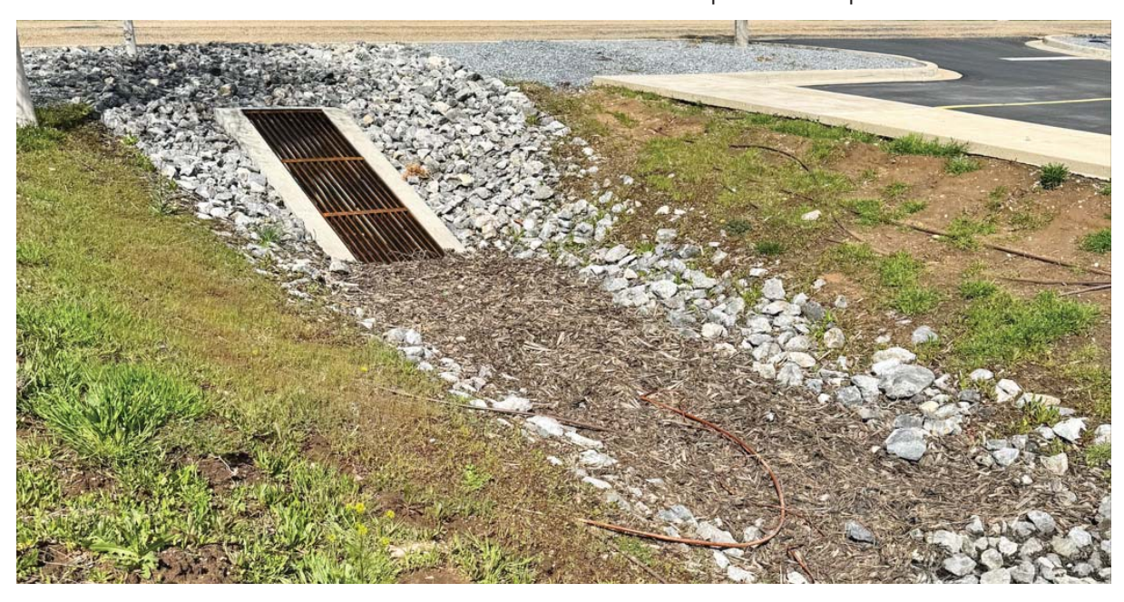
END OF ADDENDUM 1

1. The debris in the bottom of the basin should be cleaned out as part of the scope of work.