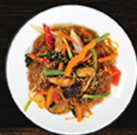
VEGETABLES JAB CHAE