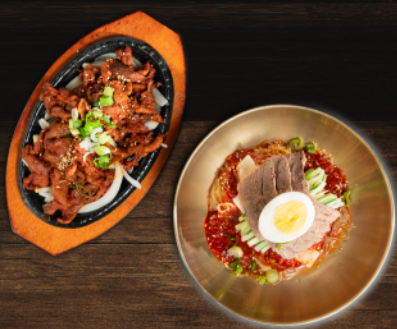
BIBIM-NAENG MYEON + BBQ SPICY PORK