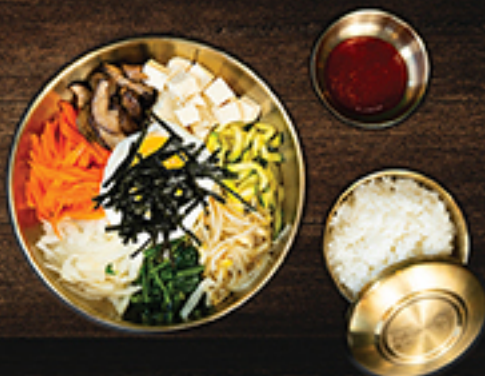
VEGETABLE & MUSHROOM

POACHED VEGETABLES W. SALT, SESAME OIL & A FRIED EGG SERVED W. MISO SOUP, WHITE RICE & CHOICE OF PROTEIN