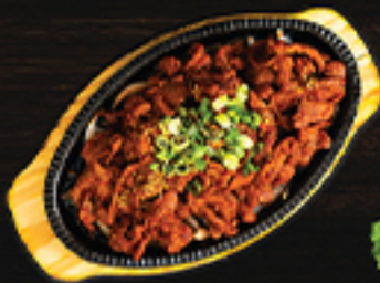
BBQ SPICY PORK