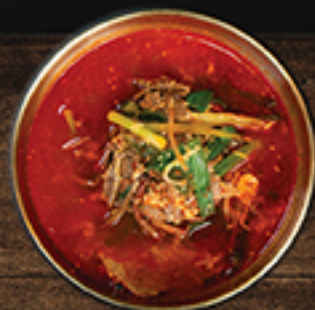
YOOK GAE JANG