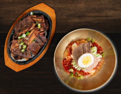
BIBIM-NAENG MYEON + BBQ GALBI