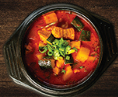
GOCHUJANG PORK BELLY STEW