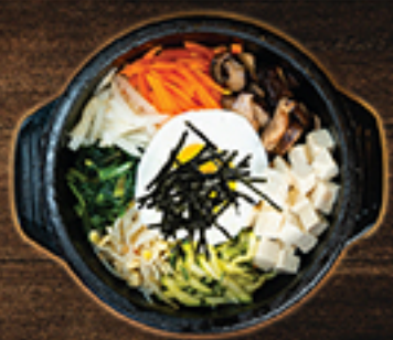
VEGETABLE & MUSHROOM

WHITE RICE, VEGETABLES, MUSHROOMS, TOFU & EGG SERVED IN A HOT STONE BOWL SERVED W. MISO SOUP, WHITE RICE & CHOICE OF PROTEIN