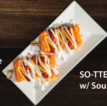
SO-TTEOK SO-TTEOK w/ Sour cream & Cheese sauce