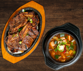
BBQ GALBI + SOY BEAN PASTE STEW