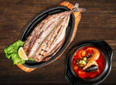
GRILLED MACKEREL + SOFT TOFU STEW