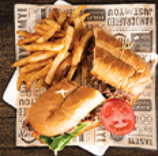
BULGOGI STEAK SANDWICH

CHOICE OF CRISPY FRIES OR KIMCHI FRIES (ADD $1 FOR KIMCHI)