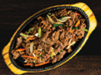
BBQ BEEF BULGOGI