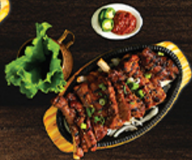
BBQ PORK SPARE RIB