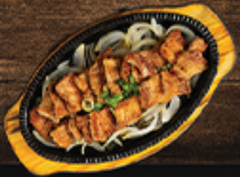
BBQ GRILLED CRISPY PORK BELLY