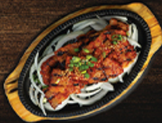
BBQ GOCHUJANG PORK BELLY