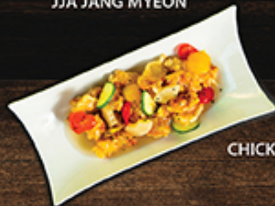
CHICKEN TANG SU

Crispy chicken thighs, pineapple, bell pepper, cucumber & onion w. sweet n sour sauce on the side