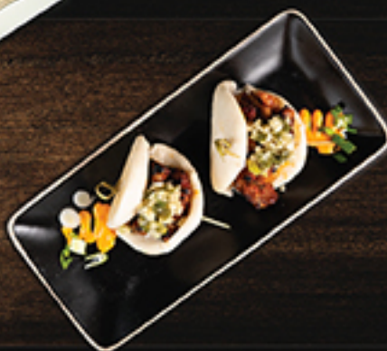
PORK BELLY BUN