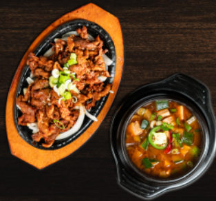
BBQ SPICY PORK + SOY BEAN PASTE STEW