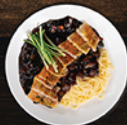
CRISPY PORK BELLY JJA JANG MYEON