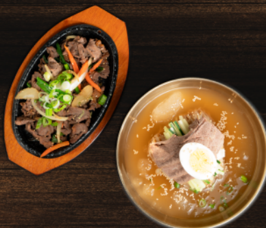
MUL-NAENG MYEON + BBQ BEEF BULGOGI