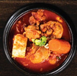
SPICY CHICKEN STEW