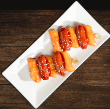
SO-TTEOK SO-TTEOK w/ Sweet & spicy sauce