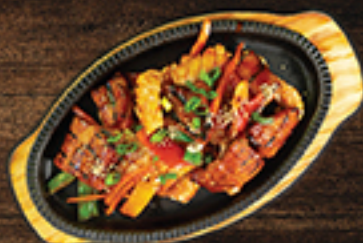
PORK BELLY & SQUID PLATTER