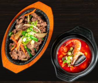
BBQ BEEF BULGOGI + SOFT TOFU STEW