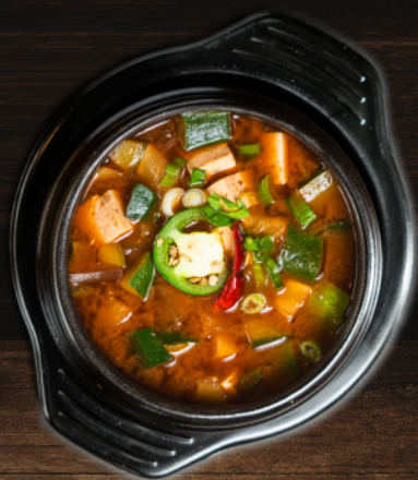
SOY BEAN PASTE STEW