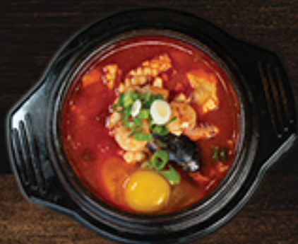
SEAFOOD SOFT TOFU STEW