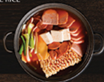
ARMY STEW HOT POT