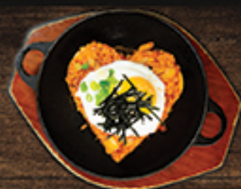
KIMCHI FRIED RICE