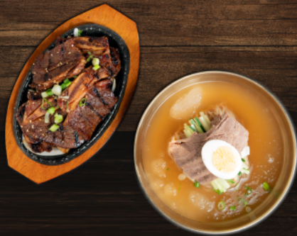
MUL-NAENG MYEON + BBQ GALBI