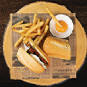
PORK BELLY BAHN MI