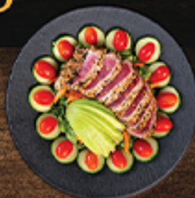
AHI-TUNA & AVOCADO SALAD