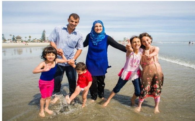
Family playing on the beach. J Cho, 2017.

The Center for Adjustment, Resilience and Recovery (CARRE) is a new initiative from the International Rescue Committee to prevent and mitigate the impact of traumatic stress on forcibly displaced children, youth and families. As a nationally designated NCTSN Category II Center, CARRE represents a collaborative effort between the IRC and the National Child Traumatic Stress Network (NCTSN), via the generous support of the Substance Abuse and Mental Health Services Administration (SAMHSA).