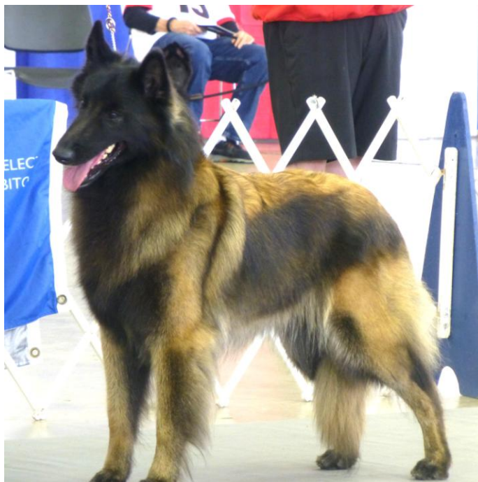
BEST OF BREED CH CIBOLA'S PIXIE FROM PETER PAN

(see Show Results, Page 5 for other dogs' names)