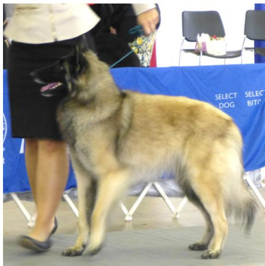
BEST OF WINNERS NOBILITY'S CHIANTI