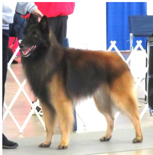
BEST OF OPPOSITE SEX CH SKY ACRES MORNING WINGS TAKE FLIGHT