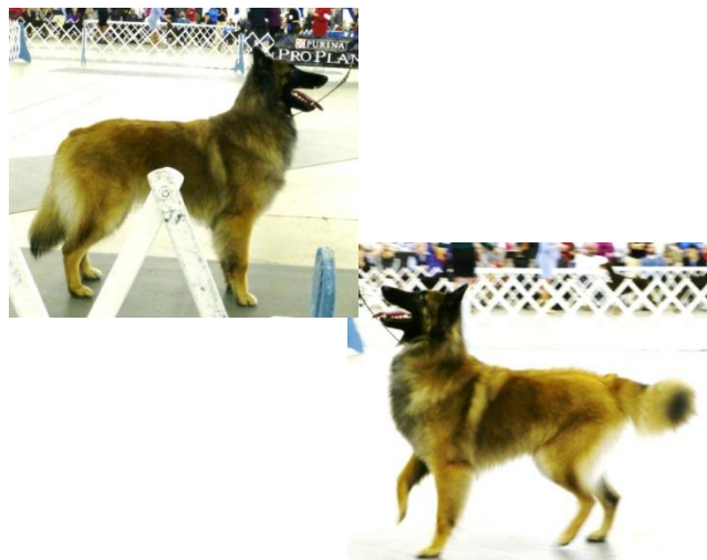
"Sadi" (stay tuned . . .)