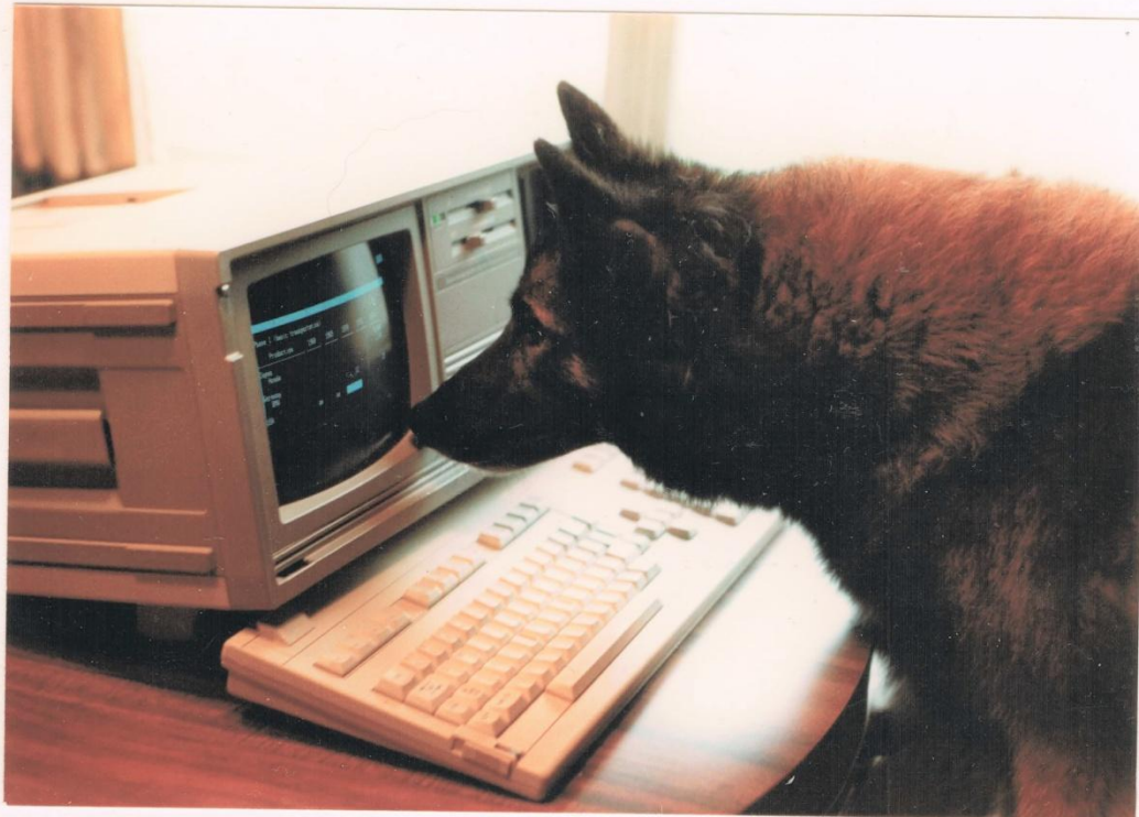
Ch. Pinot Noir de la Zia CDX HS

A Publication of the Lone Star Belgian Tervuren Club May-June 2022