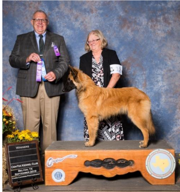
Esme's First Points

and do not care for extremes of any kind. My main focus is temperament. I want a dog that anyone can live with and one that you don't have to work at getting used to people and other dogs.