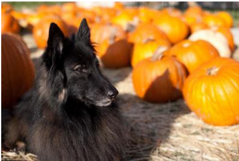
ANOTHER REMEMBRANCE OF HALLOWEEN'S PAST! BECKA