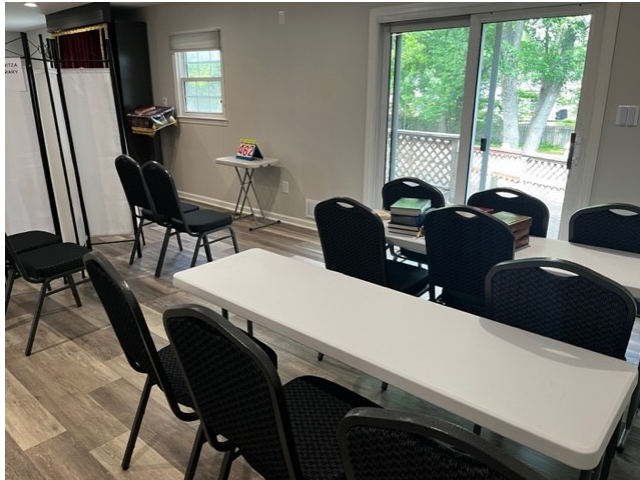
View of the Women's Section