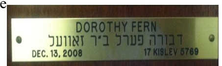
Sample of a Memorial Plaque