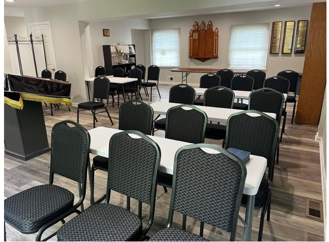
Rabbi's View of the Men's Section