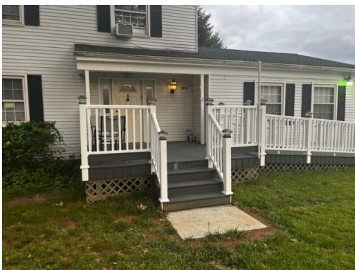
View of the lighted Accessibility Ramp

If you haven't already seen our beautiful Shul, you owe yourself a visit.