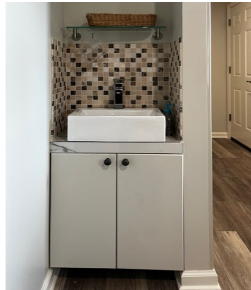
View of the Hand Washing Station