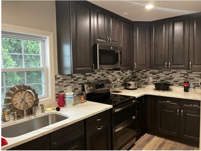
Our new kitchen