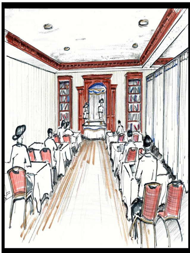
Proposed seating diagram

Young Israel of Lawrenceville has been excitedly making plans for an indoor renovation of our Shul. A beautiful brochure has been sent out – if you have not yet received one, please call the Shul and we will mail one to you. Thanks to all those who have participated so far with small and large donations, we are well underway for a successful campaign, and have reached close to TWO-THIRDS of our fundraising goal. We've also secured a reputable architect and an experienced and recommended builder to begin the work, please G-d, in November. Thanks to the generosity of so many friends and community members we have reached this far, but more