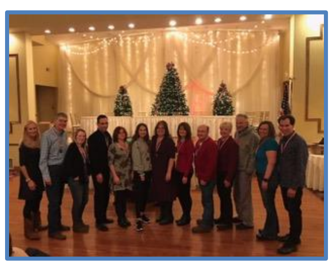
Award Winners: (LEFT to RIGHT)