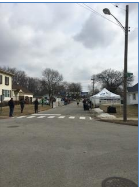
First Female and Male Runners