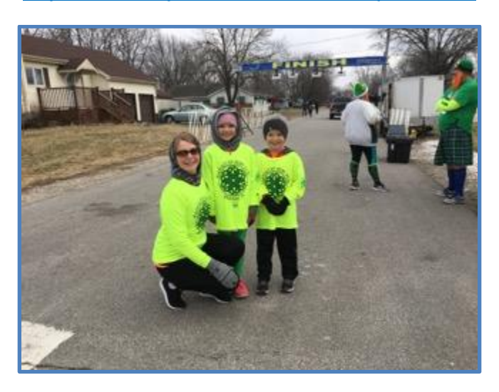
This picture titled "Three Smiler"