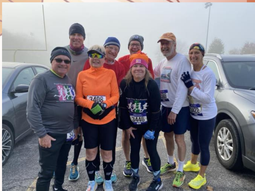
PSRR runners after the race.

The race was well run, except that one needed to return to Tinley Park on Monday to pick up their medal if they had placed.