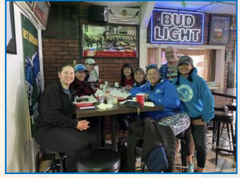
If you choose to end at Symerton, you can reward yourself at the Symerton Tap & Grill. And don't forget to reward your driver!