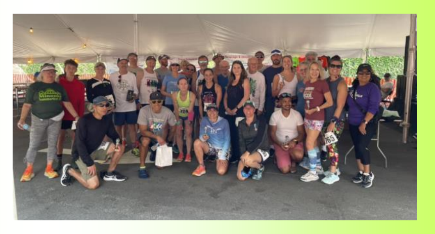
Some of the PSRR award winners.