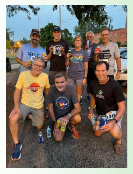
Some of the PSRR award winners.