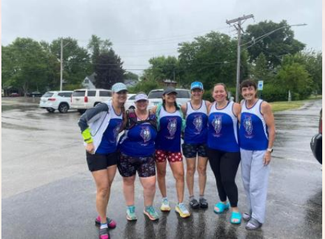
One of the last team photos before celebrating the end of the challenge.