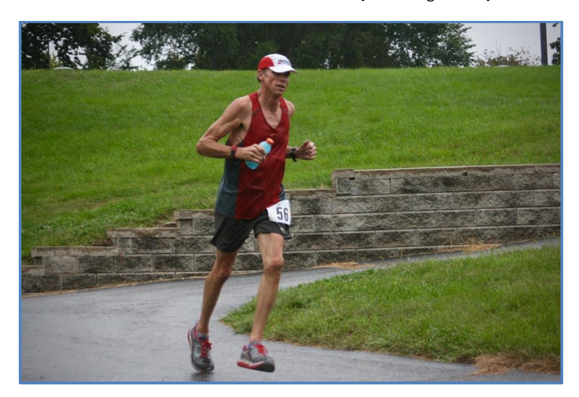
The Pacesetter: September and October 2019 Volume 44, Issue 5 Newsletter of the Prairie State Road Runners—Will County's Running Authority Since 1975