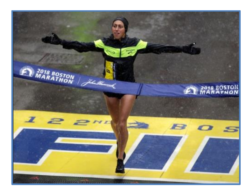
"Fast running isn't forced. You have to relax and let the run come out of you."