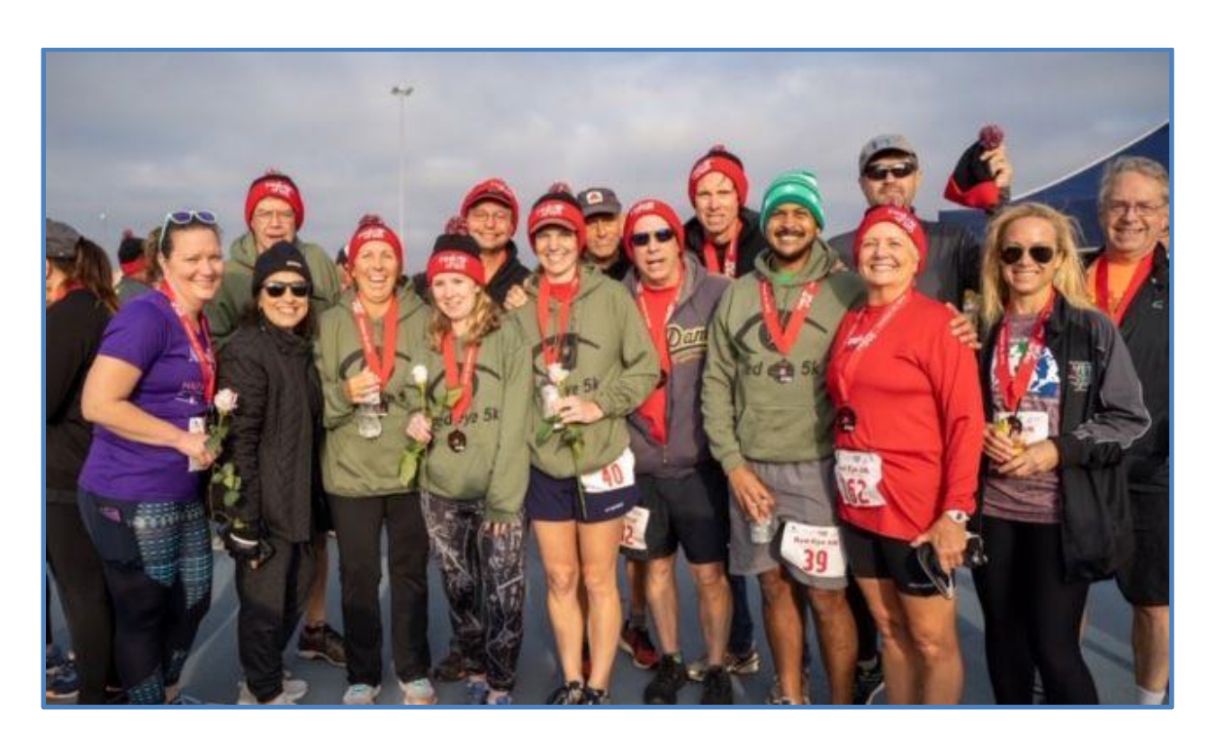
Age Group Award Winners in RED Hats

https://www.itsyourrace.com/results.aspx?id=10211