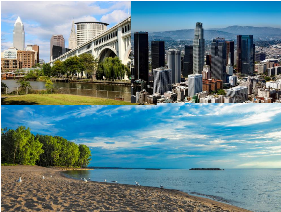
Top left: Cuyahoga River in downtown Cleveland

As a Green Chalice congregation, we have committed to be people “who wish to live out their faith by caring for creation.” Let’s make every day Earth Day.