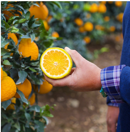
December fruit maturity

Fruit taste, texture, appearance, and overall quality of citrus fruits do not happen by accident. Farming is similar to engineering: there must be a plan, there must be mechanics, and execute on the plan. I spend significant time evaluating the fruit, the nutrition plan, and pest/disease treatments to tailor a budget and plan for each block.