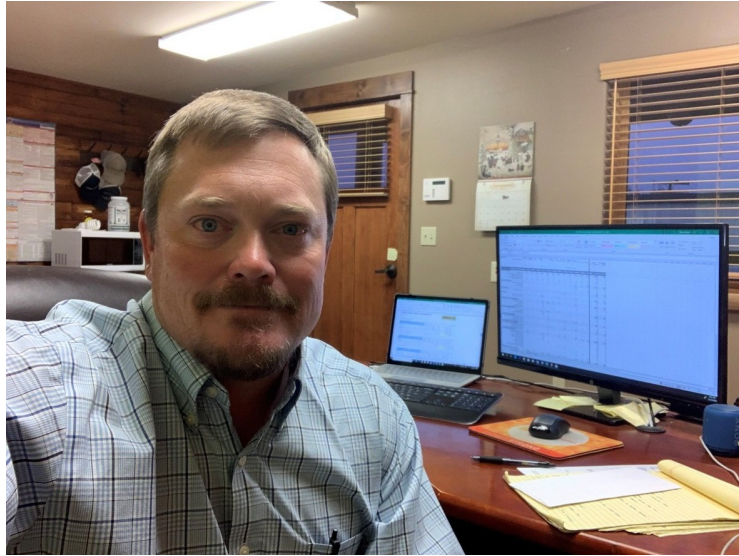
Lockdown time in the office

As in any business, the budgeting for expenditures and inputs is a requirement for planning purposes. We have created tracking systems that are routinely maintained to keep a running tally of expense and product throughout the year. We evaluate purchases and understand expense to guide decision making throughout the year.