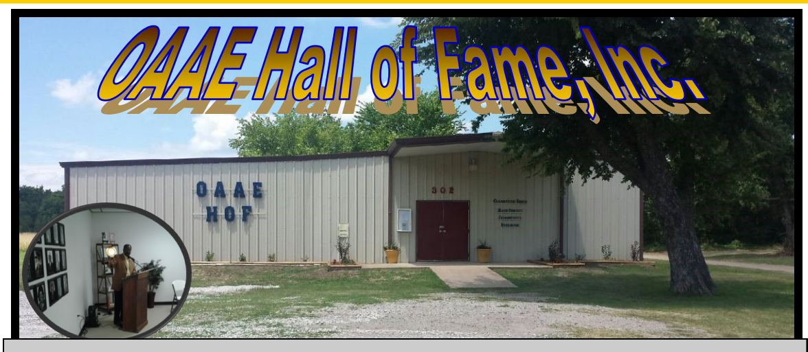
Honoring The Past - Celebrating The Present - Looking To The Future