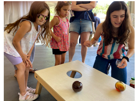
Education and fun intersect during the summer science activities for kids!