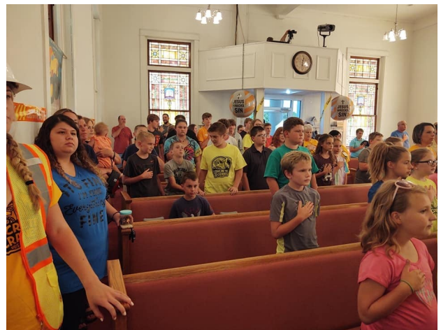
Pg. 4 of our Newsletter has more VBS pics.

God continues to bless us richly at First Baptist and we are extremely grateful to him and everyone who worked throughout the week in VBS.