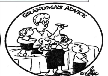
12-8 © 2004 by Keane, Inc. All rights reserved. www.familyjokes.com "Hear that? People in heaven have ever-laughing life." "If you're ever headed the wrong way in life, remember the road to Heaven allows U-turns."