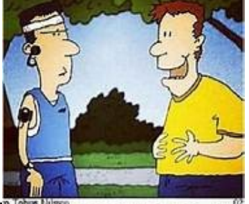
"If I send my prayer as a text message, will I get a faster reply?" I KNOW MY BODY IS A TEMPLE... I'M A MEGA-CHURCH