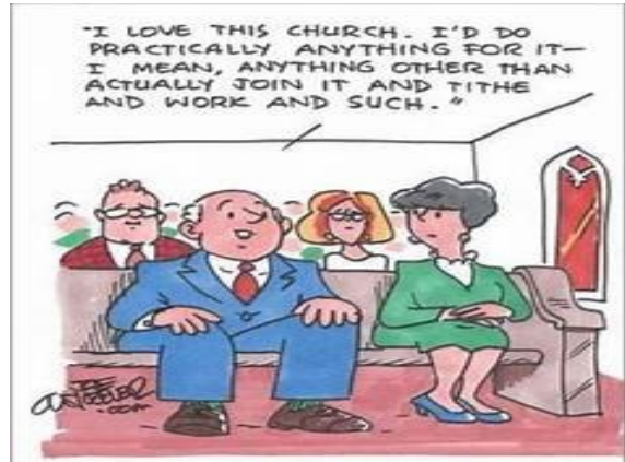
"I LOVE THIS CHURCH. I'D DO PRACTICALLY ANYTHING FOR IT— I MEAN, ANYTHING OTHER THAN ACTUALLY JOIN IT AND TITHE AND WORK AND SUCH."