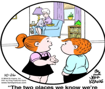
"The two places we know we're always welcome are church and Grandma's house."