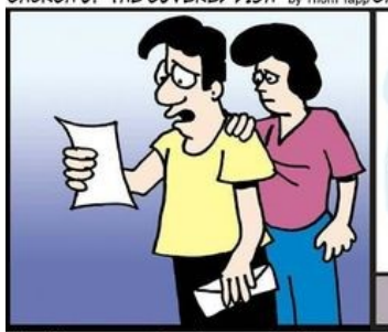
CHURCH OF THE COVERED DISH by Thom Taps